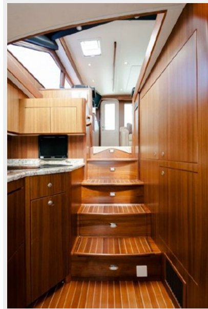
Steps from Salon to Galley