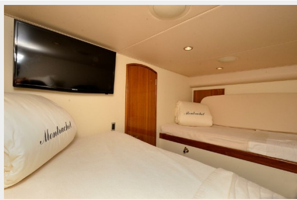
Guest Stateroom - Aft View