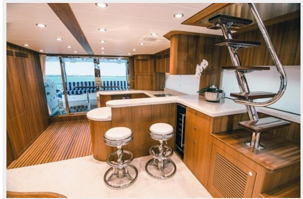
Aft Galley Option