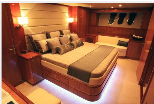
Port Side Midship Cabin