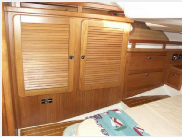
Master Closets (Stbd)