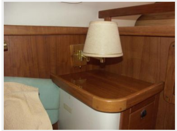
Master Nite Stand