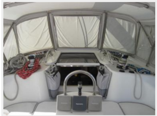
Dodger and Companionway