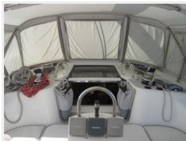
Dodger and Companionway