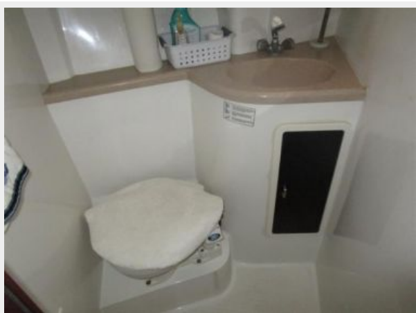
Catalina Forward Stateroom En-Suite Head