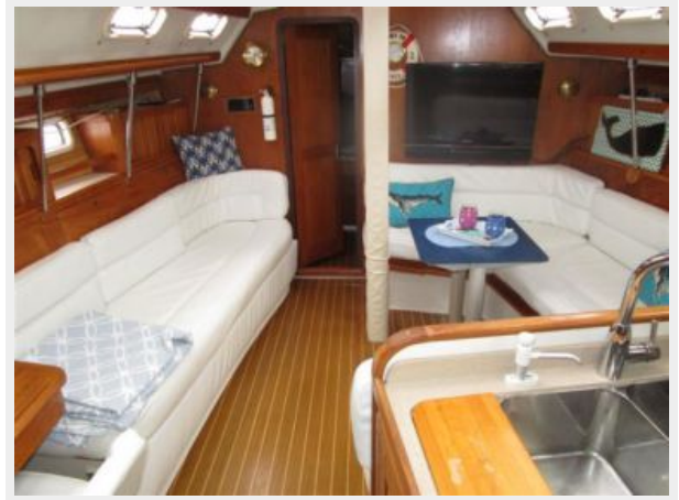
Catalina Main Salon & Skylights