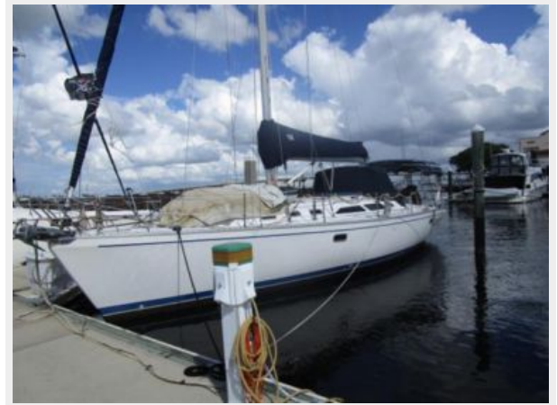
Catalina Port View