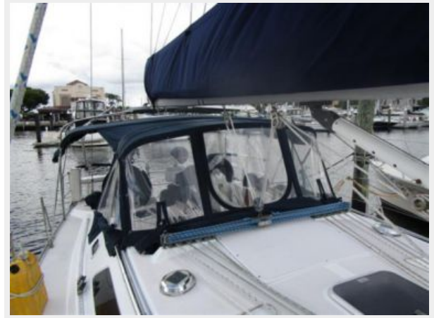
Catalina Dodger With Isinglass