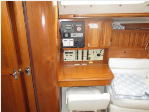
Catalina Port Side Navigation Center