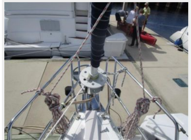
Catalina Roller Reef/Anchor