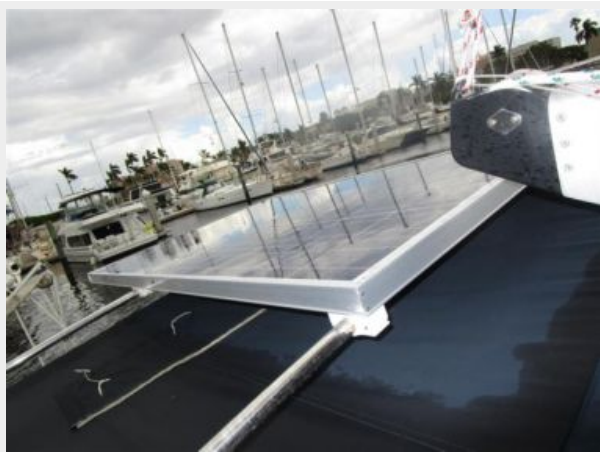
Catalina Solar Panels