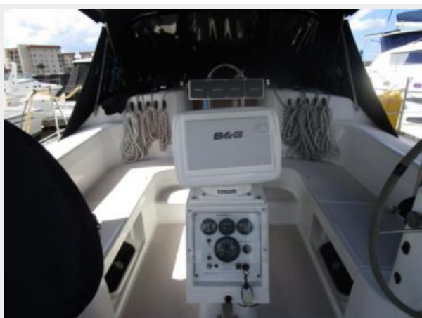
Catalina Cockpit View Forward