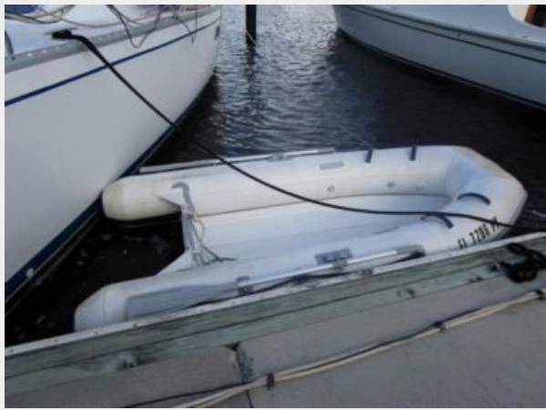
Catalina Mercury 10&apos; Hardbottom Dinghy