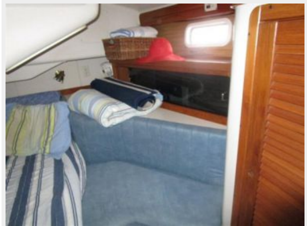
Catalina Aft Mastter Side Couch