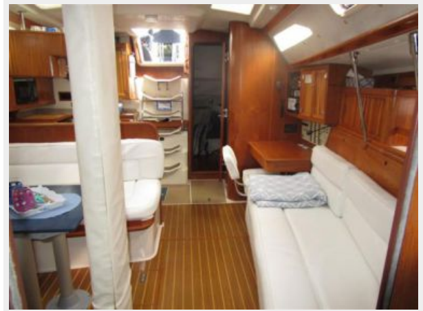
Catalina Forward Salon View Aft