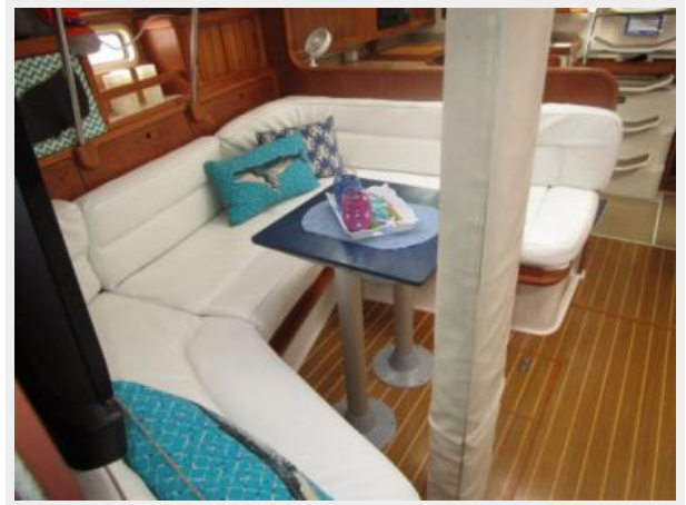
Catalina U Shape Settee 2