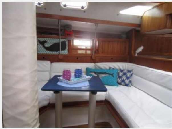
Catalina U Shape Settee to Starboard