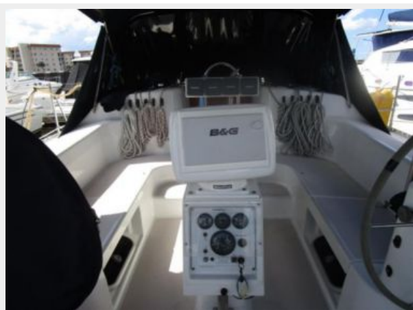
Catalina Cockpit View Forward