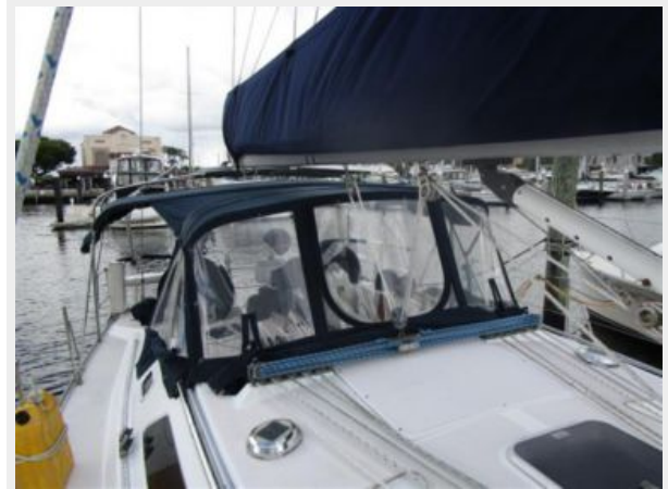
Catalina Dodger With Isinglass