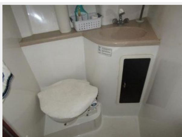
Catalina Forward Stateroom En-Suite Head