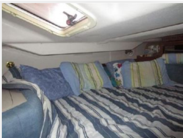
Catalina Aft Master Stateroom