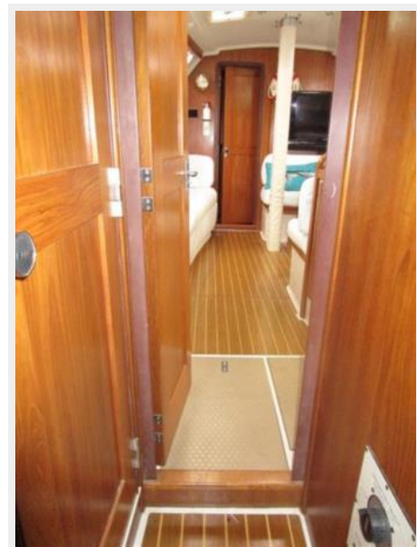
Catalina Aft Master View forward