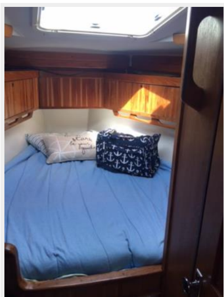
Catalina Forward Guest Stateroom