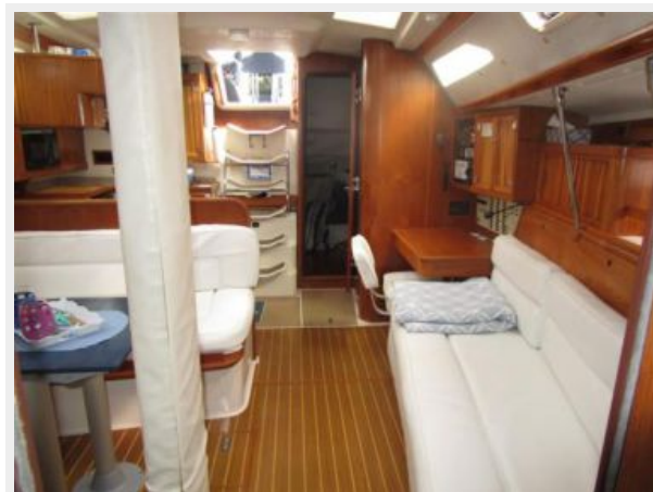
Catalina Forward Salon View Aft