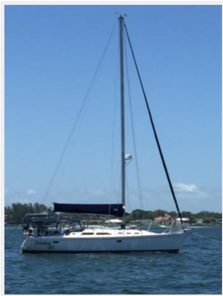
Catalina Starboard Vie