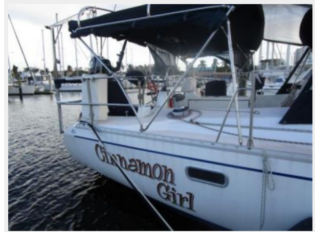
Catalina Starboard View