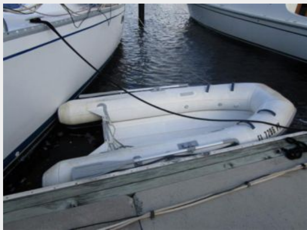
Catalina Mercury 10&apos; Hardbottom Dinghy