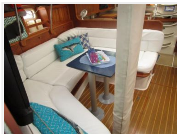
Catalina U Shape Settee 2