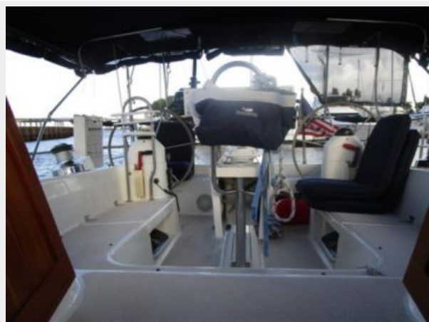
Catalina Cockpit View Aft