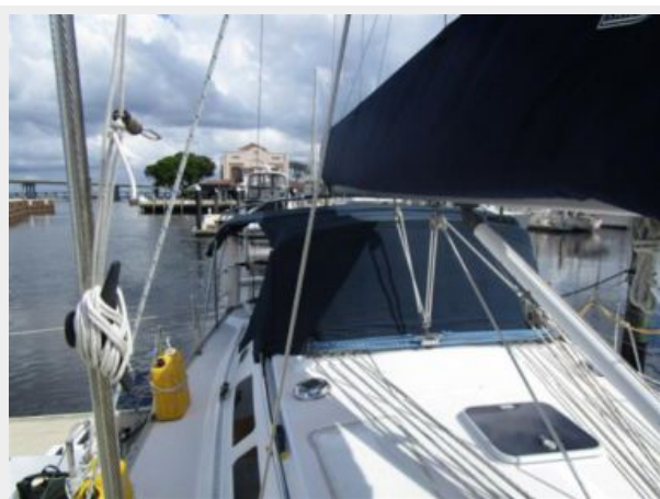
Catalina Dodger Cover