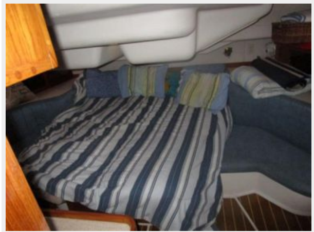
Catalina Aft Master Centerline Queen Berth