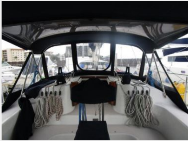
Catalina Cockpit View Forward