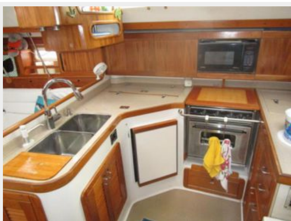
Catalina Galley to Starboard