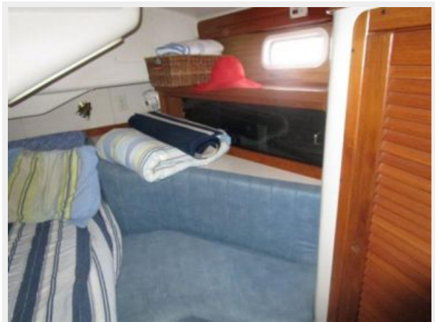
Catalina Aft Mastter Side Couch