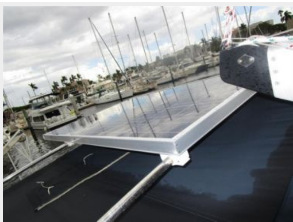
Catalina Solar Panels