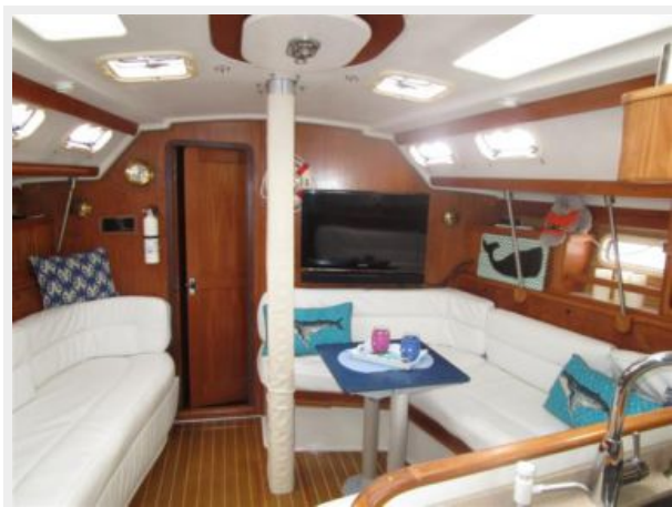
Catalina Main Salon