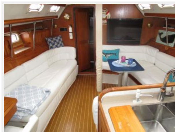
Catalina Main Salon & Skylights