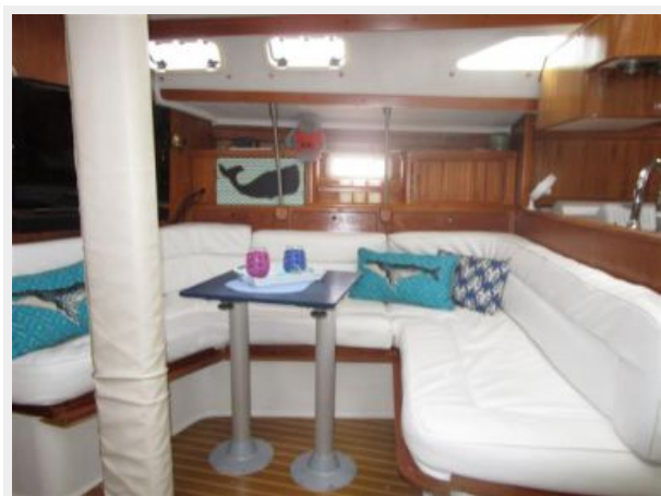
Catalina U Shape Settee 3