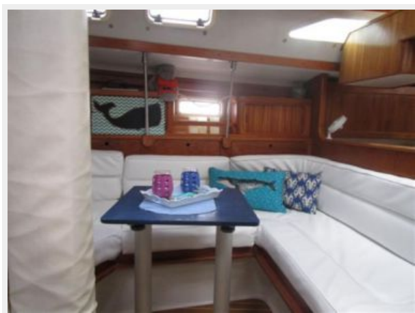
Catalina U Shape Settee to Starboard