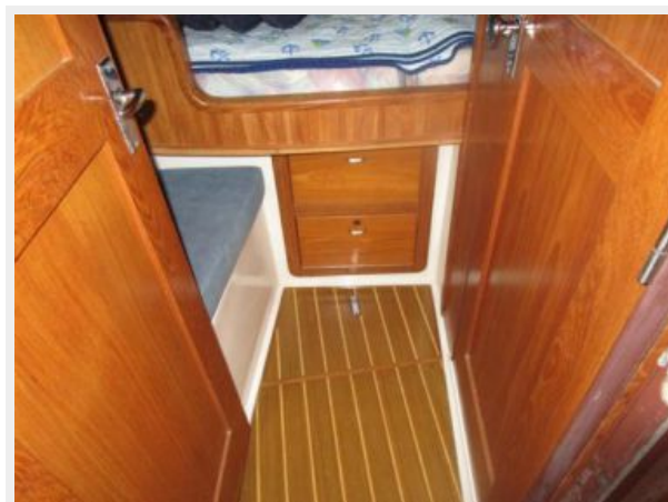
Catalina Forward Stateroom Bench & Storage