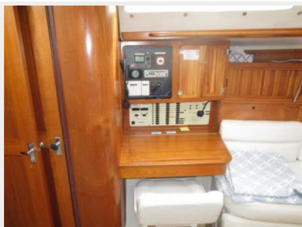
Catalina Port Side Navigation Center