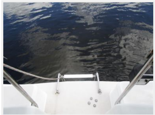
Catalina Access To Swim Platform