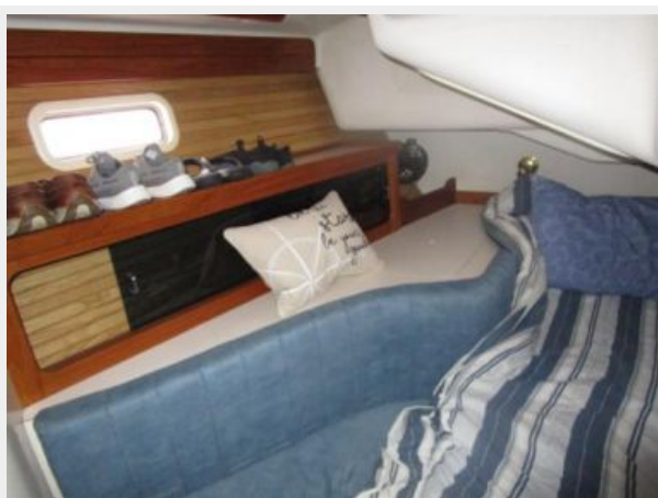
Catalina Aft Master Starboard Side Couch