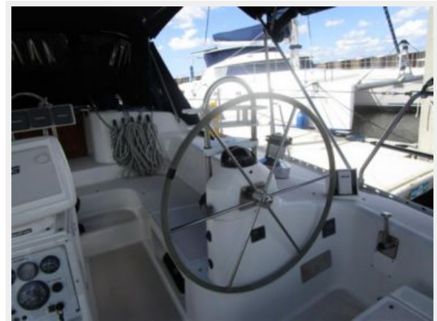
Catalina Starboard Helm