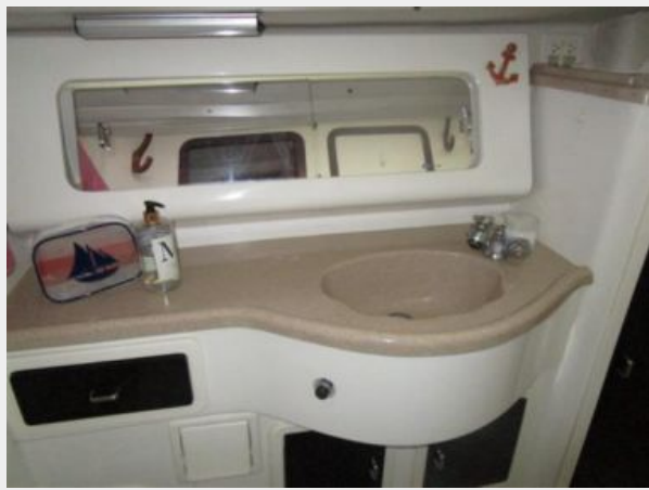
Catalina En-suite Sink