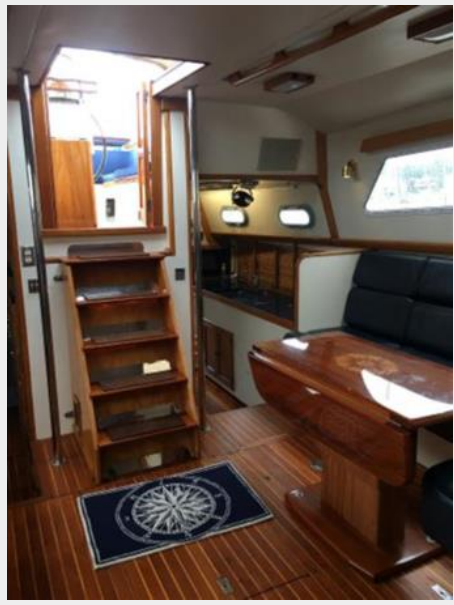
Hinckley 64 'Allegiance' - Main salon looking aft