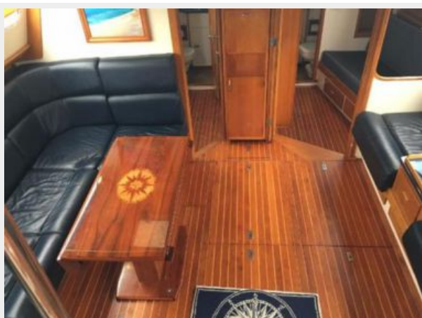
Hinckley 64 'Allegiance' - Main salon