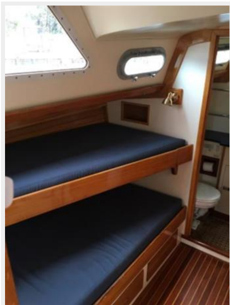
Hinckley 64 'Allegiance' - Port forward guest cabin