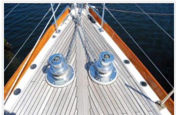
Hinckley 64 'Allegiance'