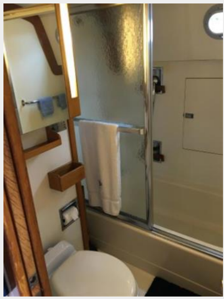
Hinckley 64 'Allegiance' - Master staeroom ensuite