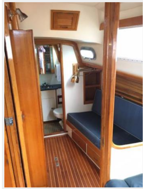
Hinckley 64 'Allegiance' - Starboard forward guest cabin/ library