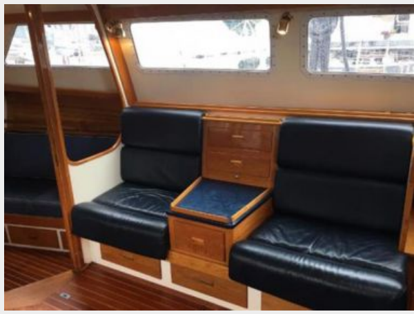
Hinckley 64 'Allegiance' - Main salon - Starboard side