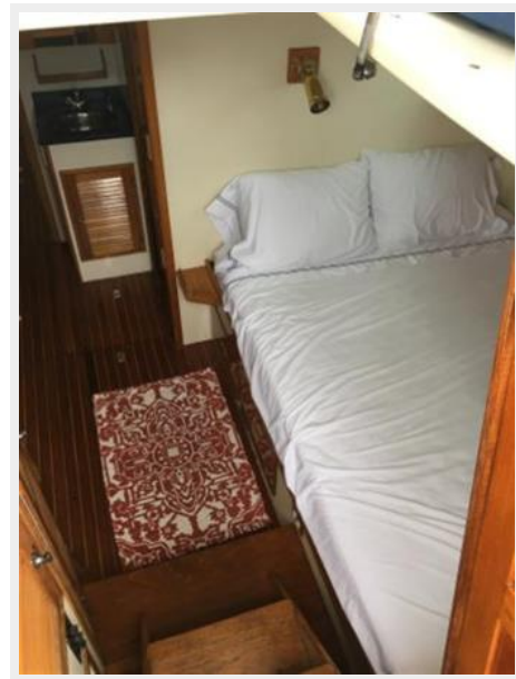
Hinckley 64 'Allegiance' - Master stateroom