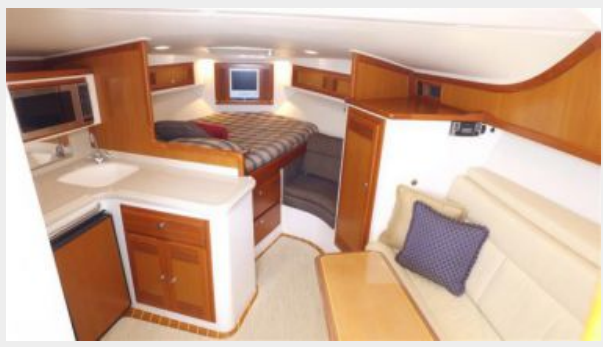
Cabin Seating / Dinette