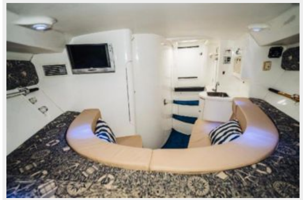
Cabin Looking Aft