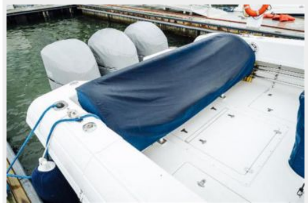
Removeable Seating Covers