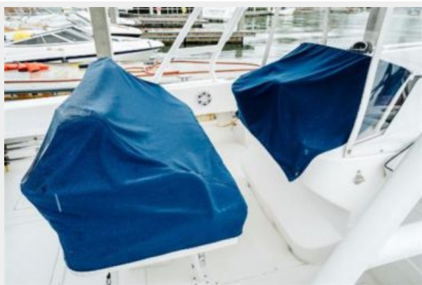
Helm Chair/Electronics Covers