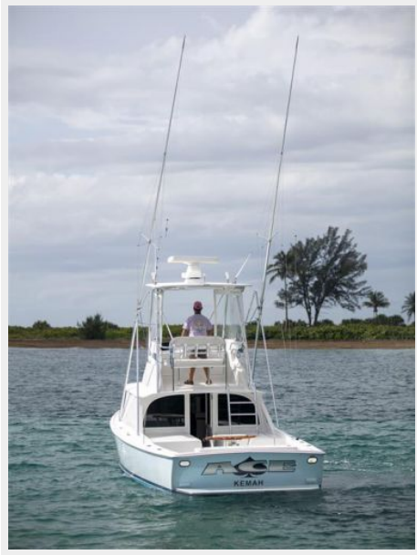
31 Bertram - Ace31 Bertram - Ace2U6A8244