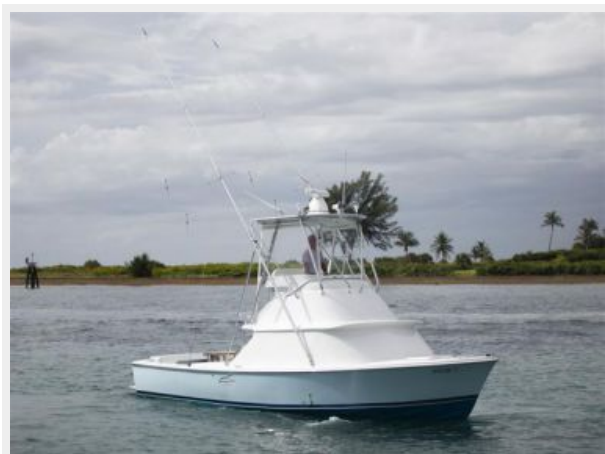
31 Bertram - Ace31 Bertram - Ace2U6A8204