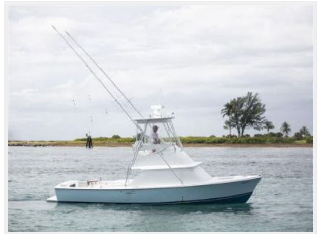
31 Bertram - Ace31 Bertram - Ace2U6A8214