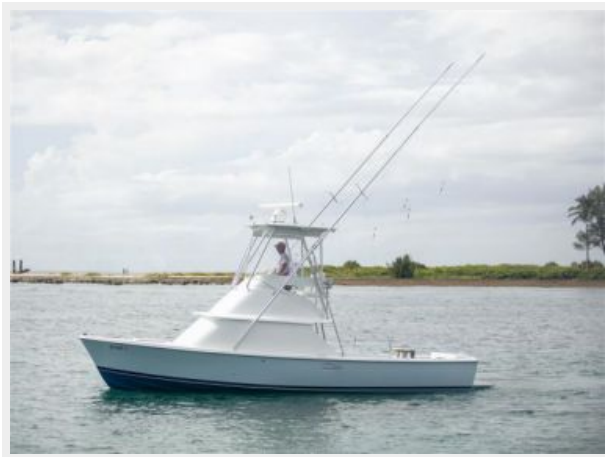
31 Bertram - Ace31 Bertram - Ace2U6A8185 31 Bertram - Ace31 Bertram - Ace2U6A8193