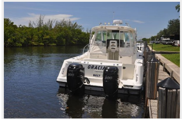
Hauled out in Ft Lauderdale / Polished and waxed June 2017