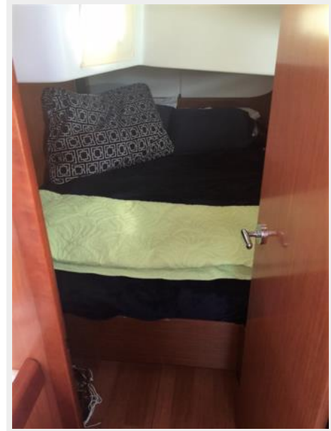
Port Aft Cabin