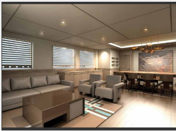
Main Salon (Sistership)