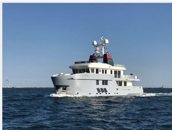
Ocean King 100 (Sistership)