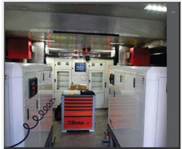
Engine Room (Sistership)