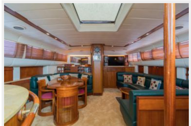
Maxi 88 Taronga salon