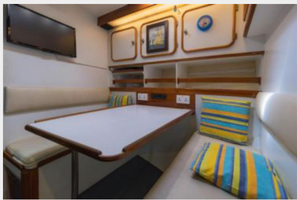
Maxi 88 Taronga crew area