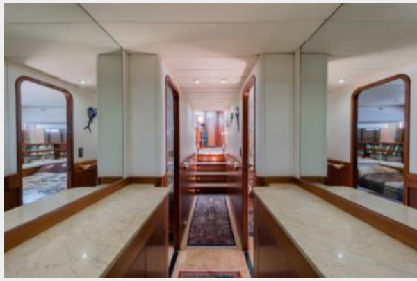
Maxi 88 Taronga