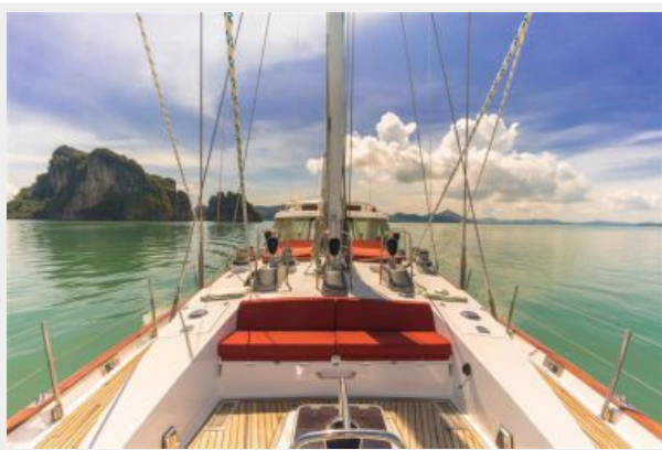
Maxi 88 Taronga front seating