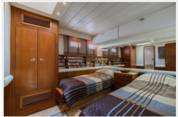
Maxi 88 Taronga Guestroom 2