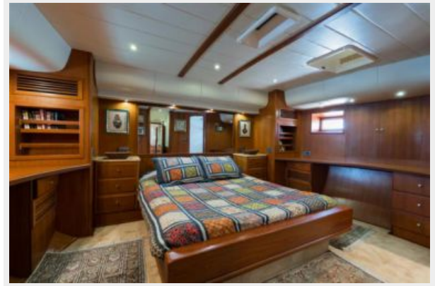
Maxi 88 Taronga Master bedroom