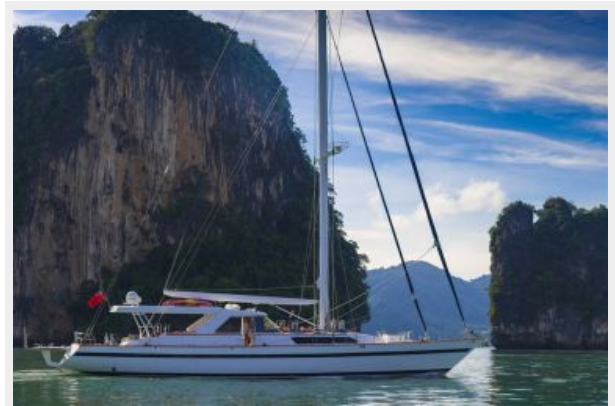
Maxi 88 Taronga