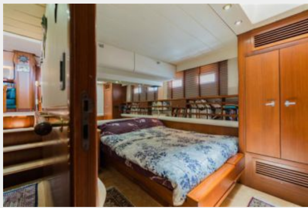
Maxi 88 Taronga Guestroom 1