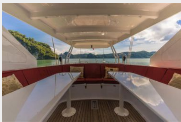
Maxi 88 Taronga cockpit seating