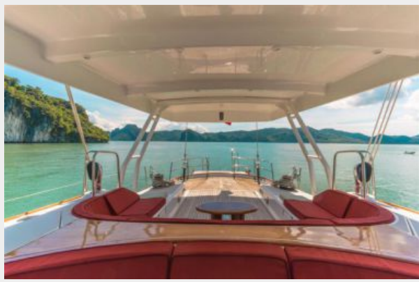
Maxi 88 Taronga lounge area view from cockpit