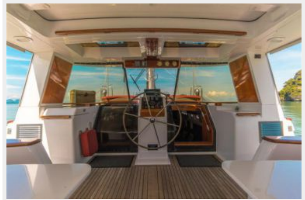
Maxi 88 Taronga cockpit