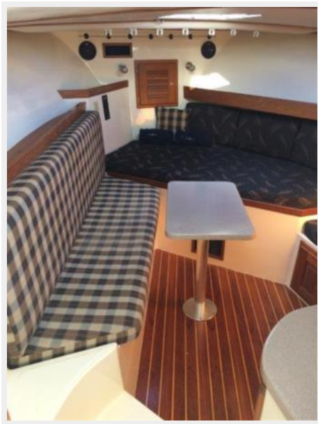
Main Cabin 1