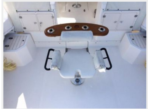
Cockpit / Fishing Equipment 4 - Fighting Chair