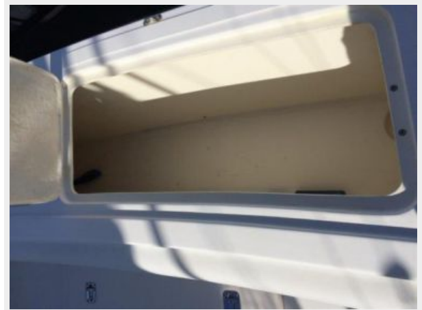
Cockpit / Fishing Equipment 6