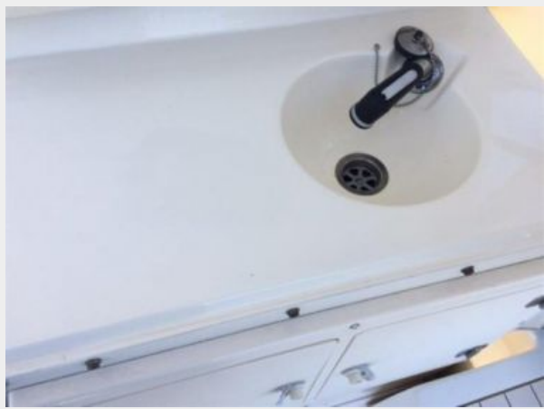
Cockpit / Fishing Equipment 3 - Cockpit Sink