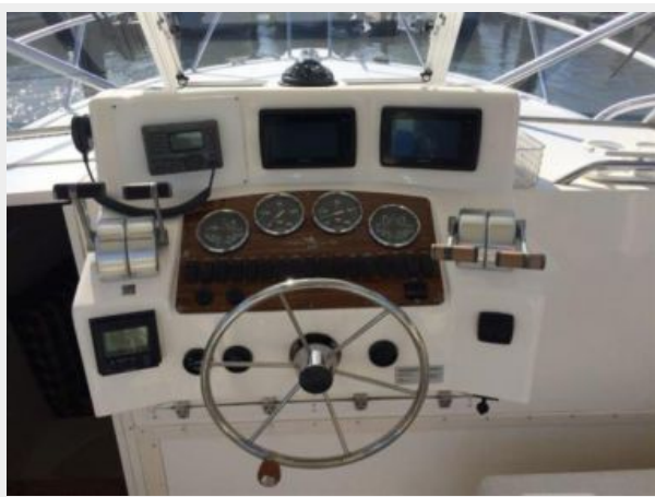
Helm / Electronics & Navigation 1