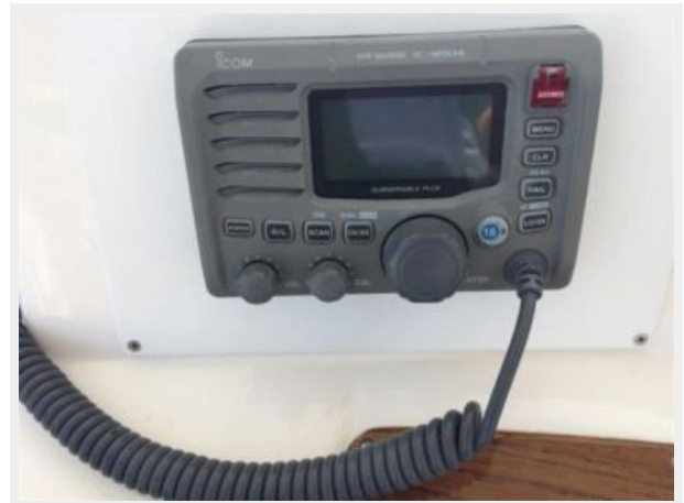
Helm / Electronics & Navigation 4 - VHF Radio