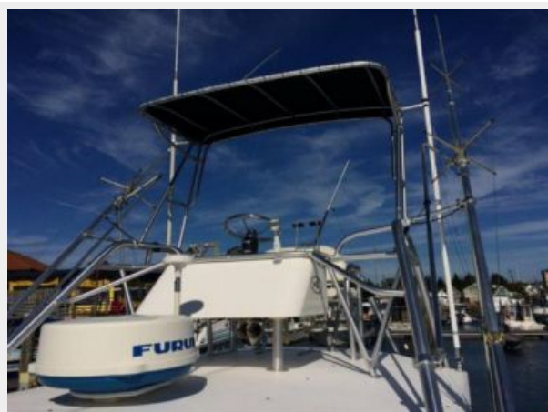
Helm / Electronics & Navigation 7 - Tower Controls