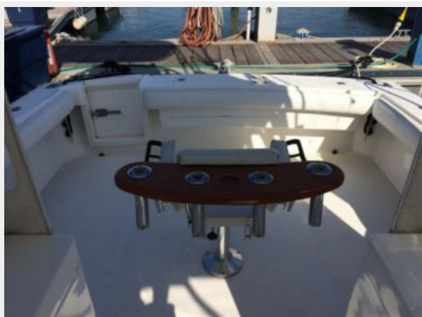
Cockpit / Fishing Equipment 5 - Fighting Chair