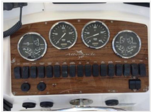
Helm / Electronics & Navigation 6 - Gauges