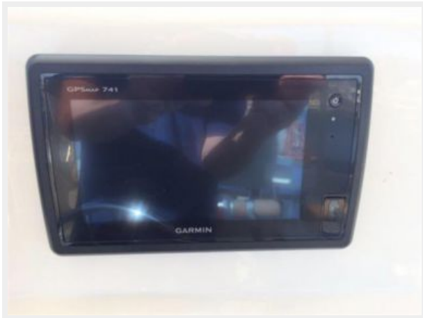
Helm / Electronics & Navigation 5 - Garmin