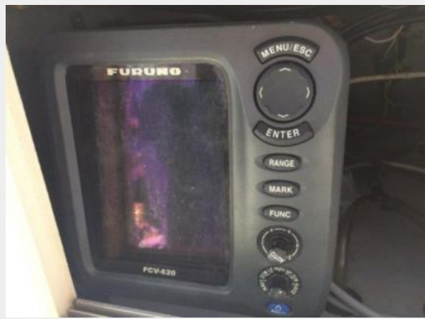
Helm / Electronics & Navigation 3 - Furuno FCV-620