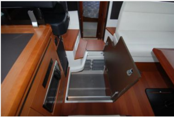
Salon floor Forward Storage