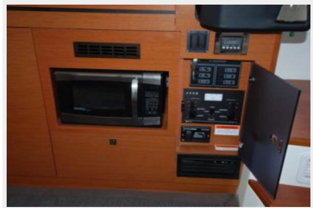
Microwave and A/C Panel