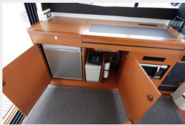
Galley Refrigerator and Storage