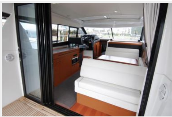
Salon doors opening strb - Dinette seating facing cockpit