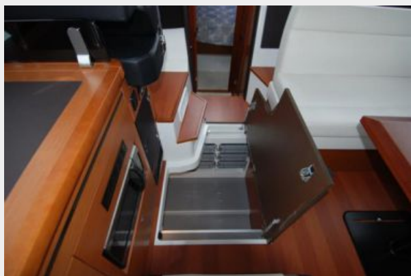
Salon floor Forward Storage