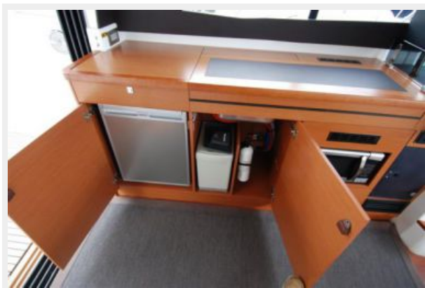
Galley Refrigerator and Storage