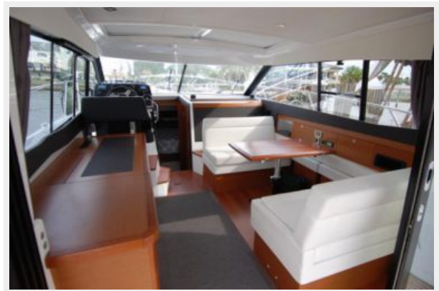
Salon - Forward dinette seat in aft facing position