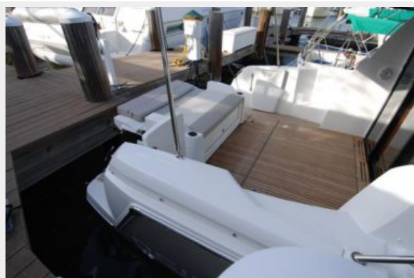
Cockpit with Bench Seating in Sunpad position