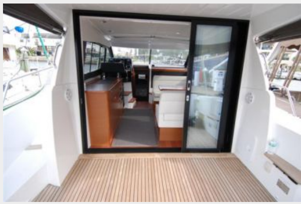
Salon doors opening port - Dinette seating in standard position