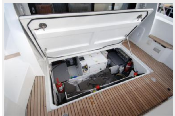
Cockpit access to generator and storage