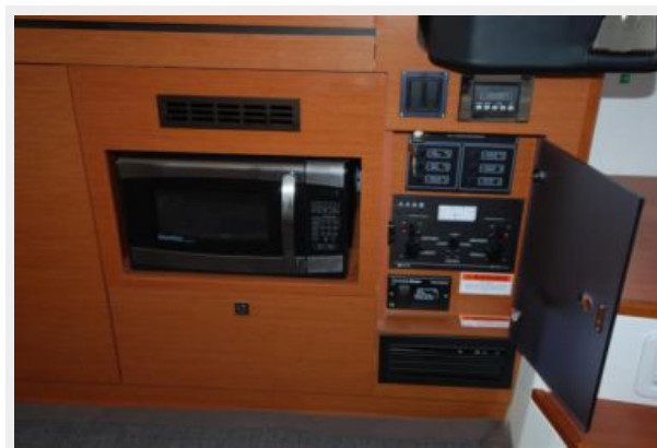
Microwave and A/C Panel