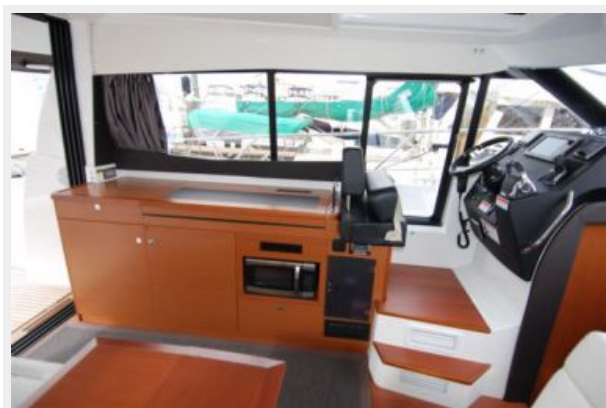
Portside Salon with Countertop closed