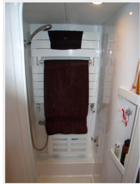
Owner's En-suite Shower