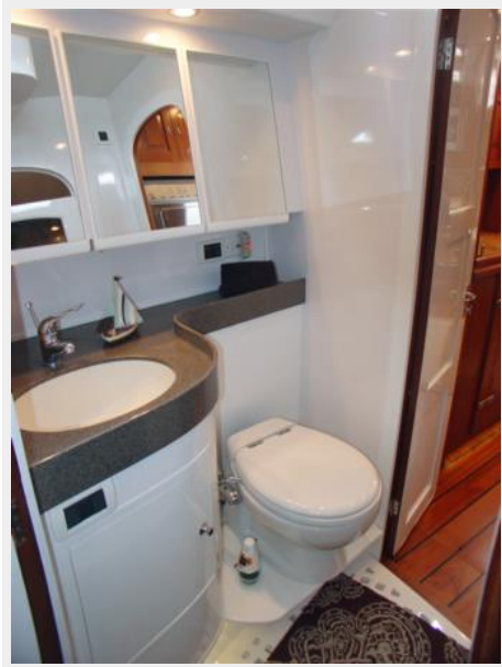
Owner's En-suite Head