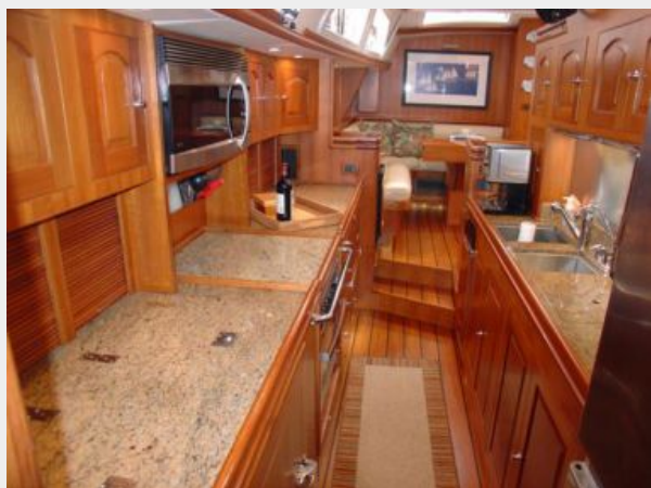
Galley, Looking Fwd.