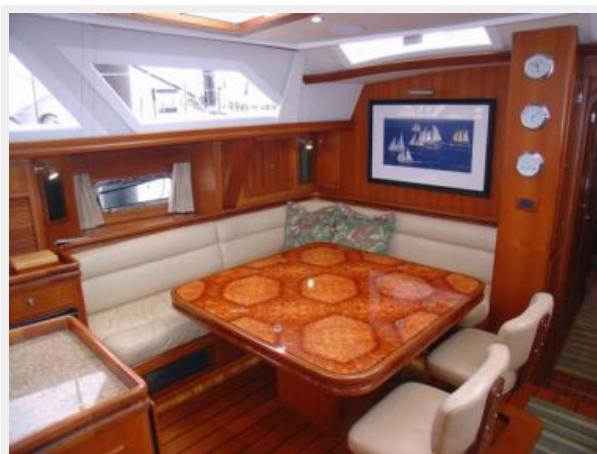
Port Salon, Table Open