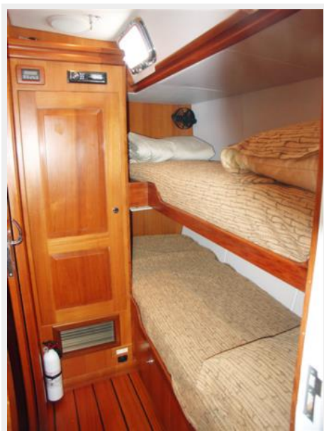
Stbd. Guest or Crew Qtrs.