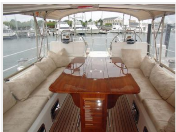
Looking Aft, Cockpit Table Extended