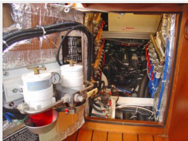
Engine Room, View from Salon