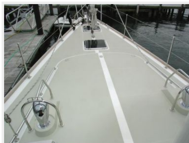
Foredeck, Looking Fwd.