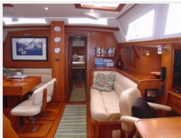
Stbd. Salon, Looking Fwd.