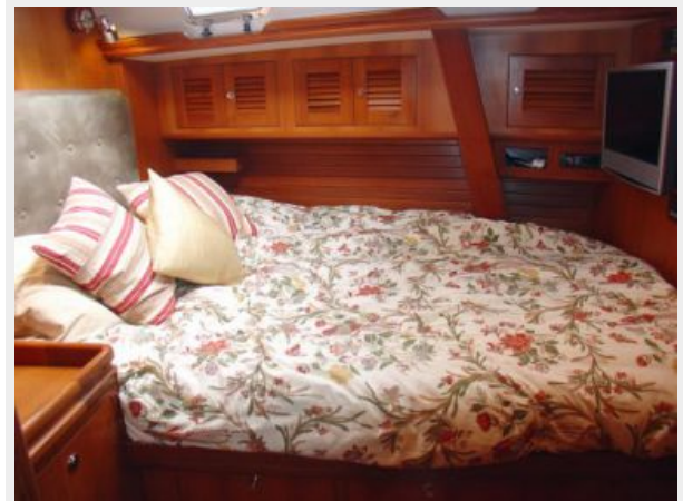
Port Guest Cabin