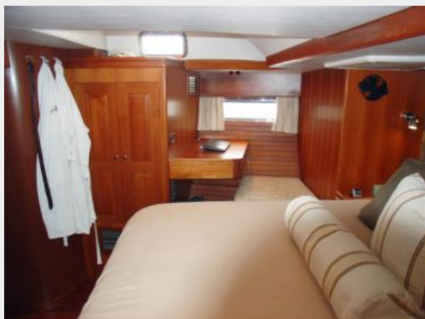
Owner's Stateroom, Stbd. Side