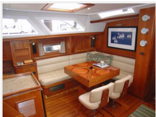
Port Salon, Table Closed