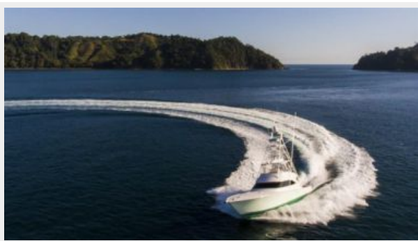
Viking 55 Convertible Running Forward