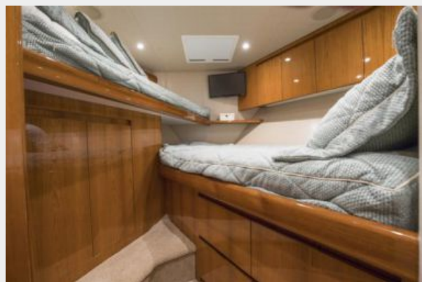
Viking 55 Convertible Forward Stateroom