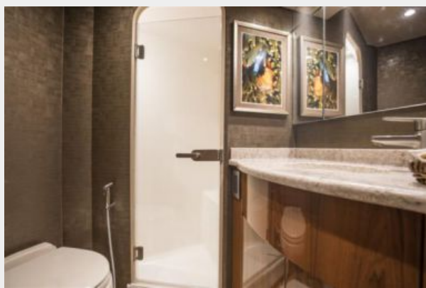
Viking 55 Convertible Head