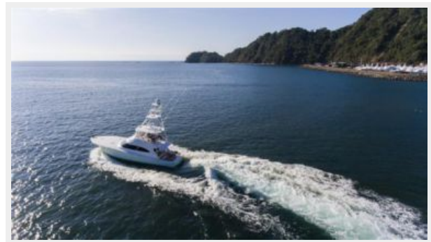
Viking 55 Convertible Running Port Profile