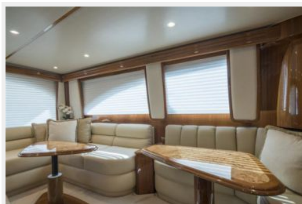
Viking 55 Convertible Salon Seating