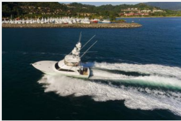
Viking 55 Convertible Running Profile