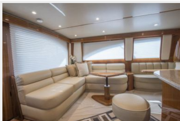
Viking 55 Convertible Salon