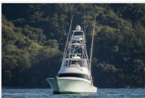
Viking 55 Convertible Port Profile