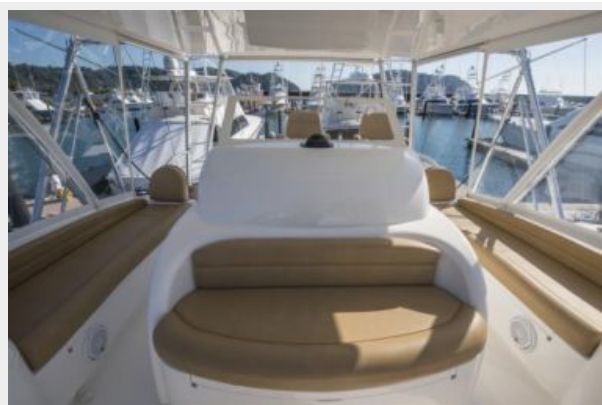
Viking 55 Convertible Helm