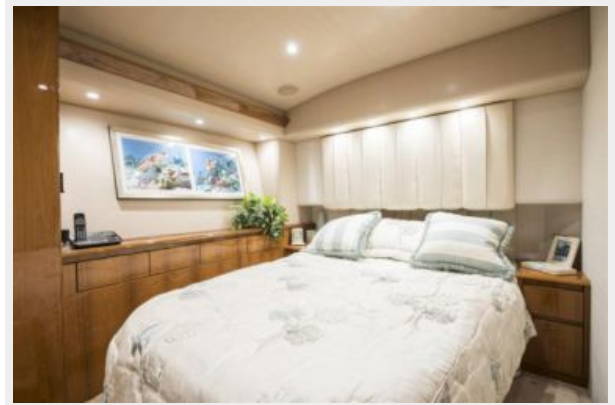
Viking 55 Convertible Master Stateroom