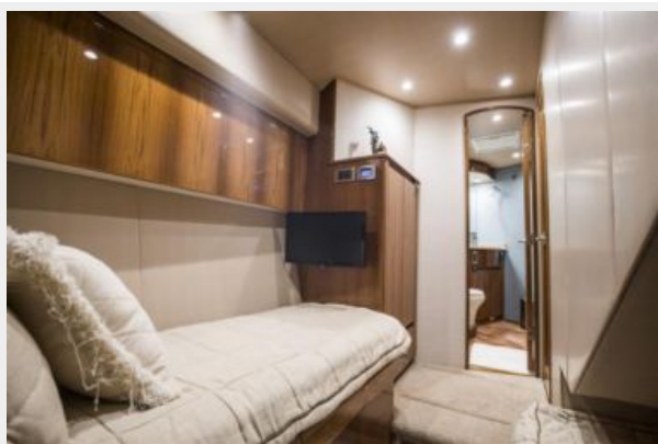
Viking 55 Convertible Guest Stateroom