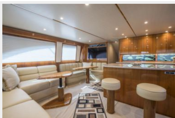
Viking 55 Convertible Salon/Galley