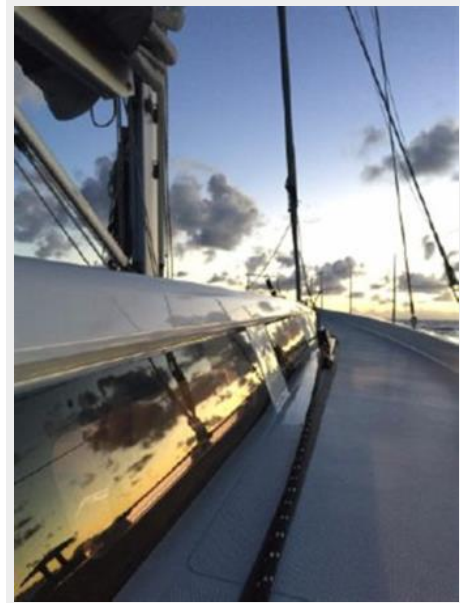
XIMERA Sunset Sail