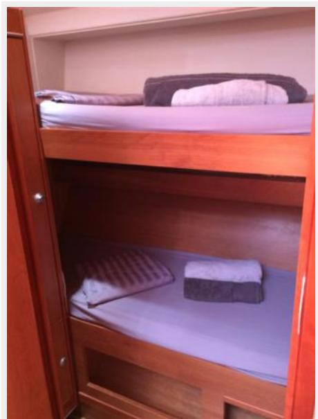
XIMERA Main Saloon