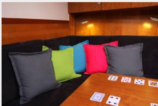
XIMERA Main Saloon