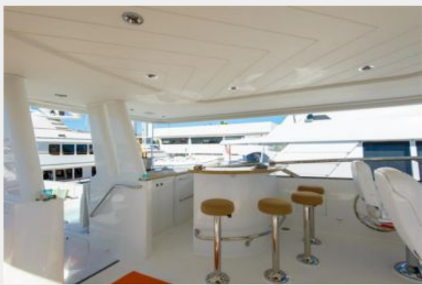
Flybridge / Bar