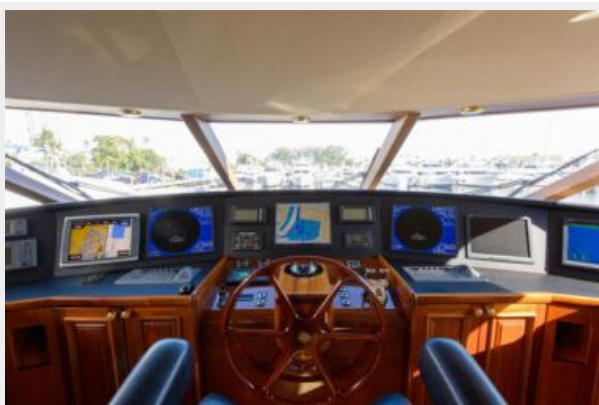
Pilothouse / Helm