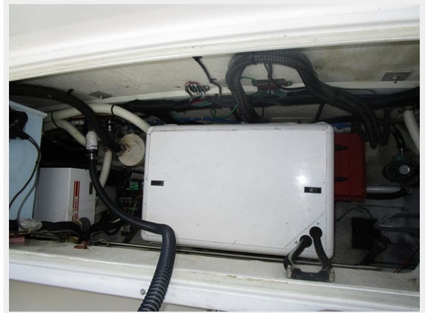
Topview 5 KW Generator