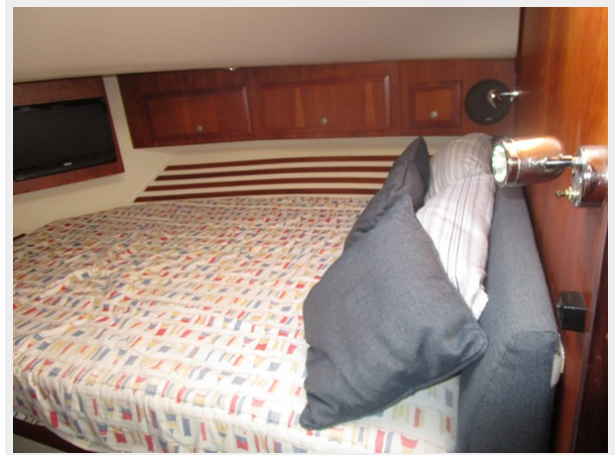
Forward Master Stateroom