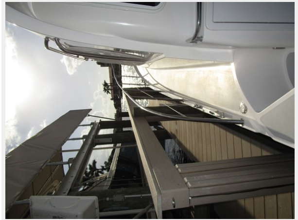
Forward deck view to port