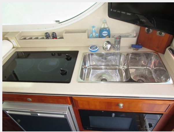
Galley up to starboard