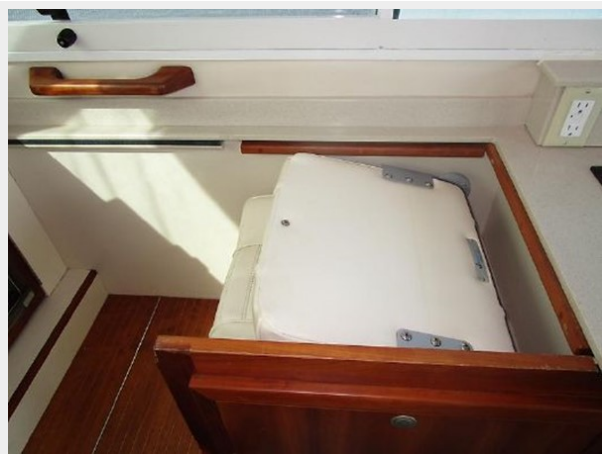
Crew seat conversion to tabletop