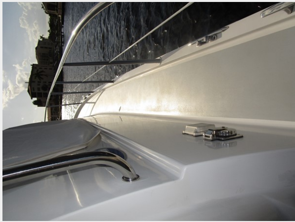
Starboard deck view forward