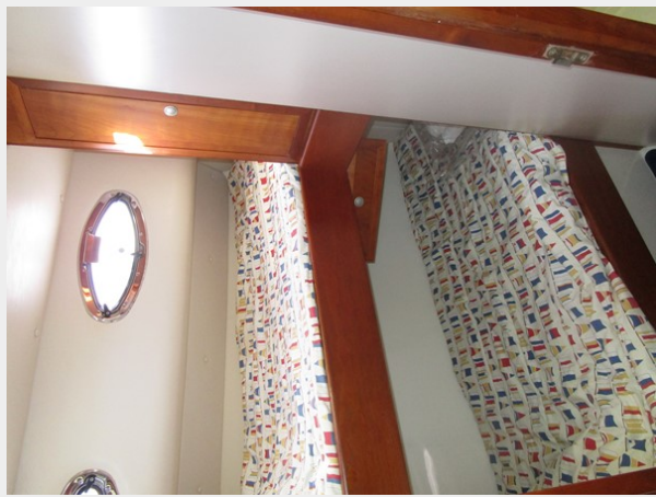
Guest stateroom to starboard