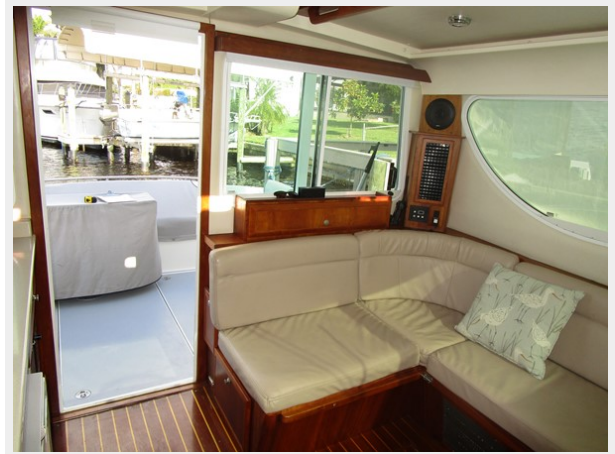
L shaped settee to port