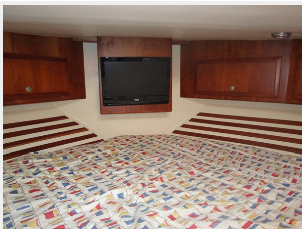
Forward Master stateroom queen berth