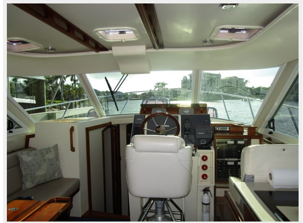
Moveable helm chair