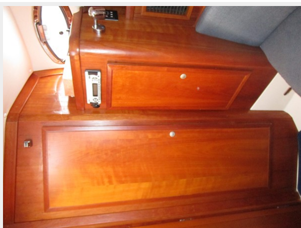
Master stateroom hanging lockers & stereo