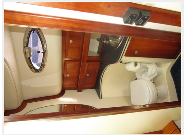
Ensuite head to port 2.