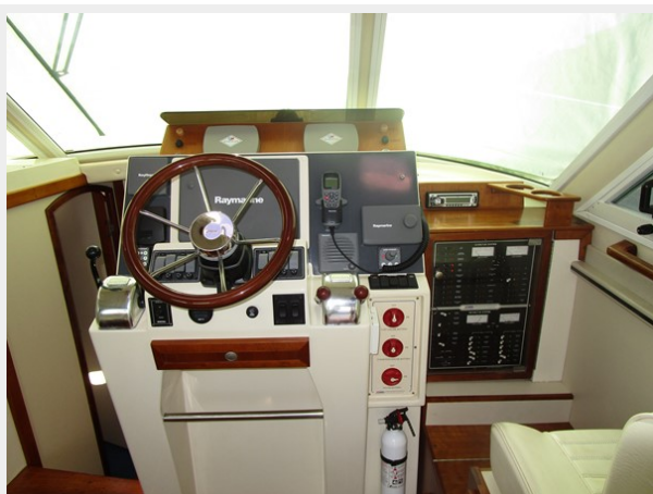
Helm view 2.