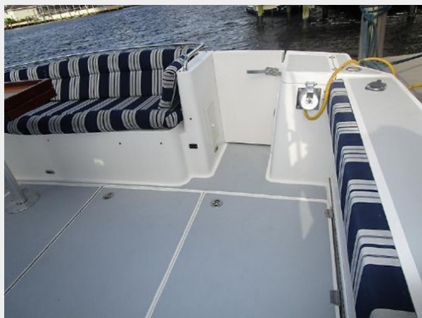
Aft transom door & 30 amp connection