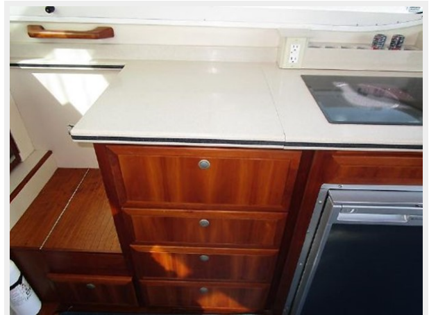
Extended counter top