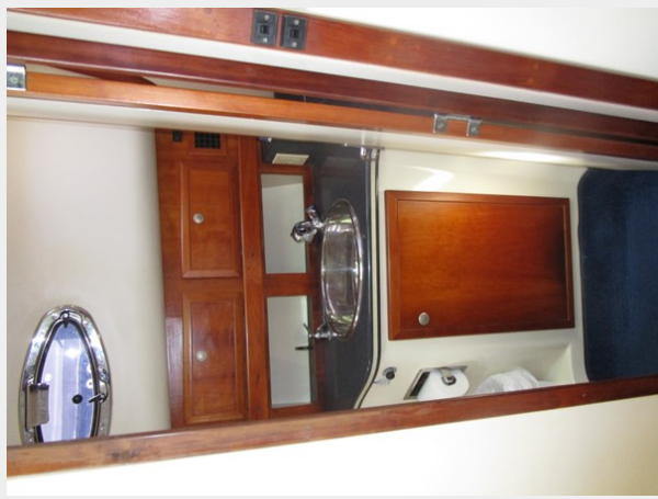
Ensuite head & sink to port