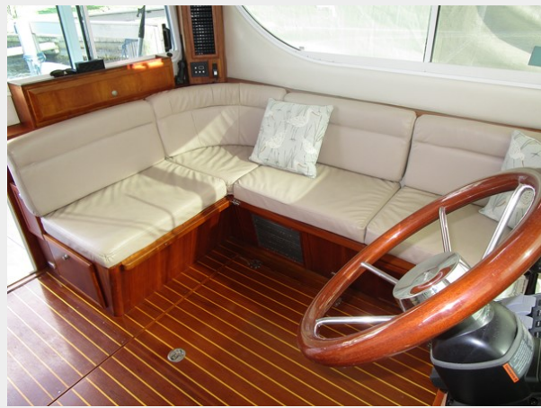
L shaped settee to port 2.