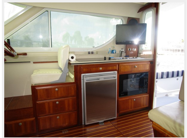
Galley up view to starboard