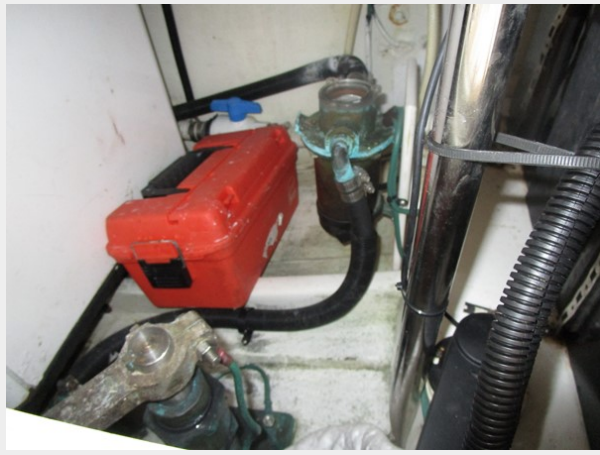
Aft steerage and generator