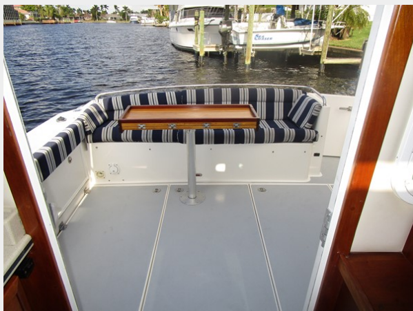
Salon view aft