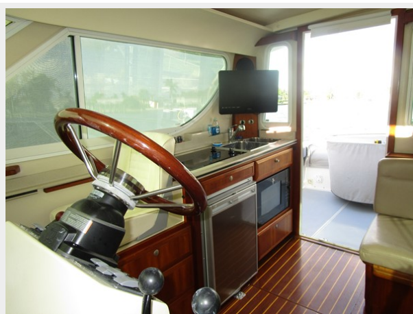
Helm view aft