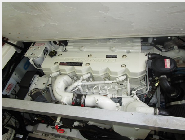
Starboard cummings diesel