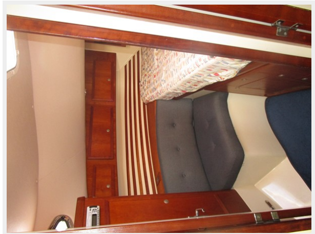
Forward master stateroom settee