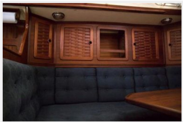
014 1989 Sabre Mark II Centerboard Port Sette