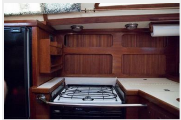
018 1989 Sabre Mark II Centerboard Galley 3 Burner Stove