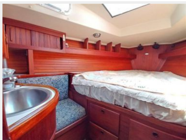
015 1989 Sabre Mark II Centerboard Forward Cabin