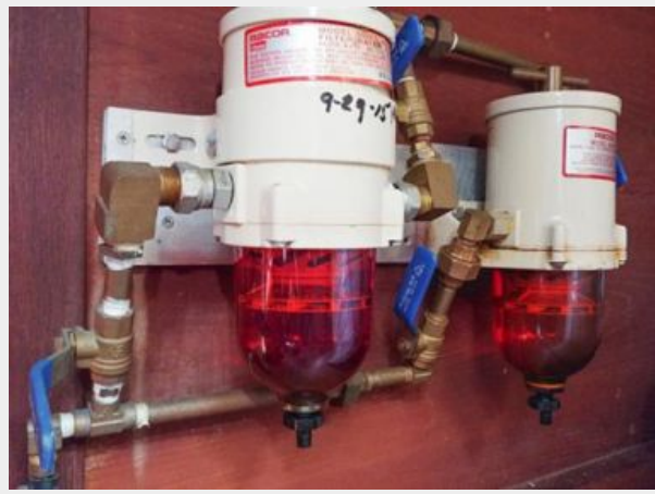
027 1989 Sabre Mark II Centerboard Racor