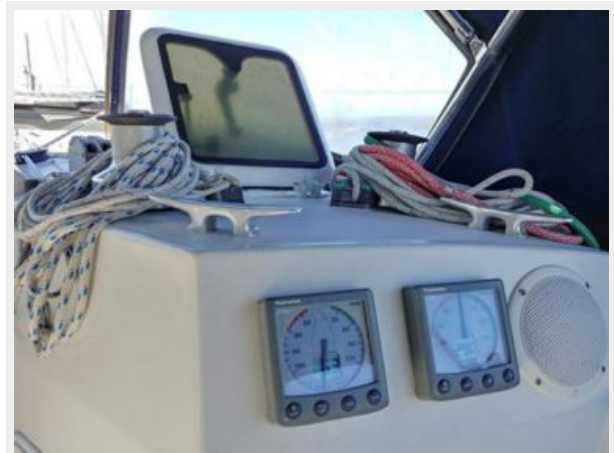
012 1989 Sabre Mark II Centerboard Starboard Cockpit Forward