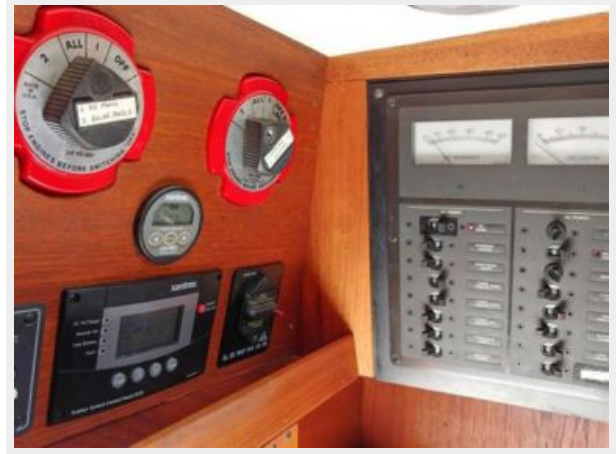
023 1989 Sabre Mark II Centerboard Custom Radio Box 024 1989 Sabre Mark II Centerboard Carbon Monoxide Detector