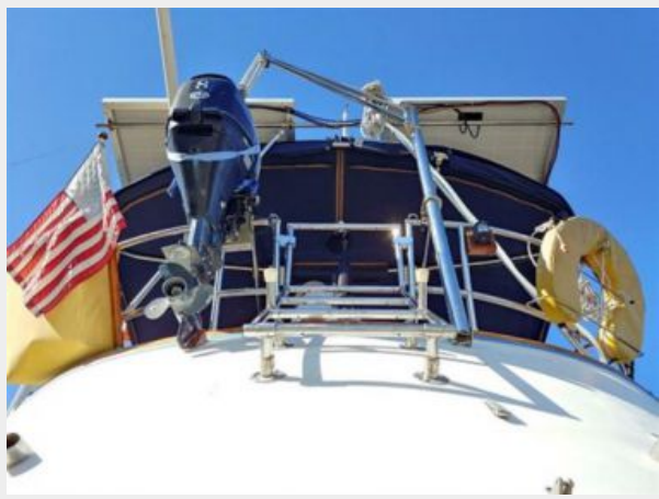
009 1989 Sabre Mark II Centerboard Aft Swim Ladder