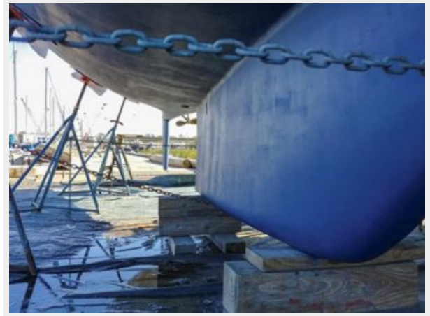
008 1989 Sabre Mark II Centerboard Keel Starboard