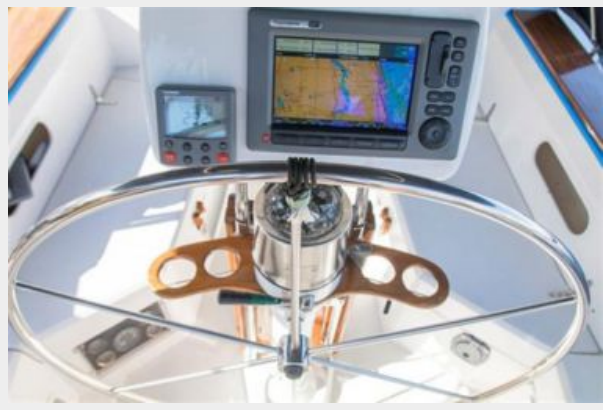
011 1989 Sabre Mark II Centerboard Helm & Electronics