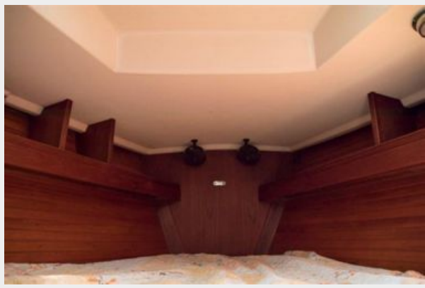
017 1989 Sabre Mark II Centerboard V-Berth