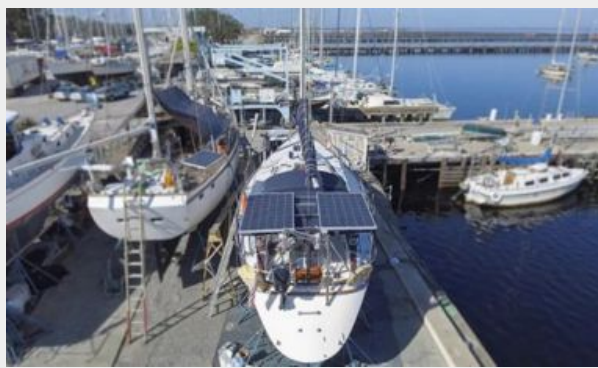
003 1989 Sabre Mark II Centerboard Above