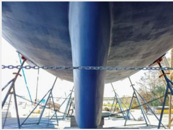
007 1989 Sabre Mark II Centerboard Keel Centerline