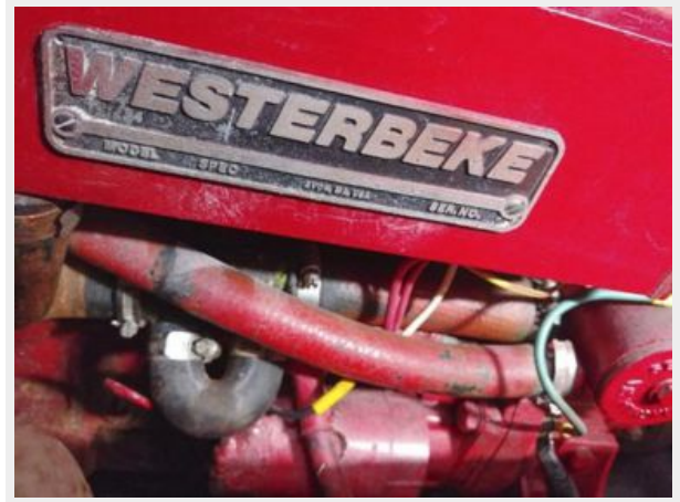
028 1989 Sabre Mark II Centerboard Engine