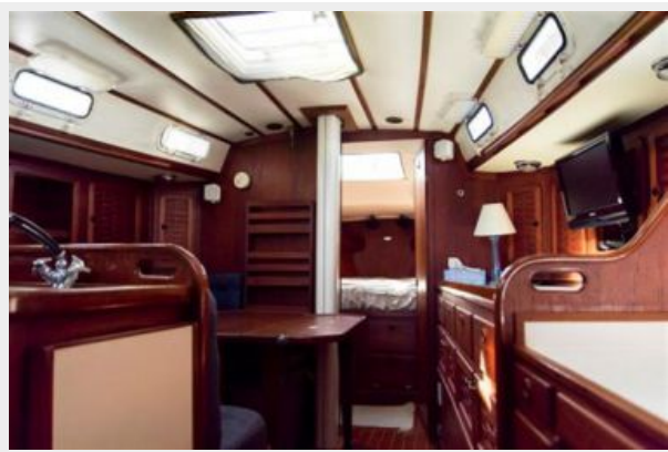
013 1989 Sabre Mark II Centerboard Main Salon