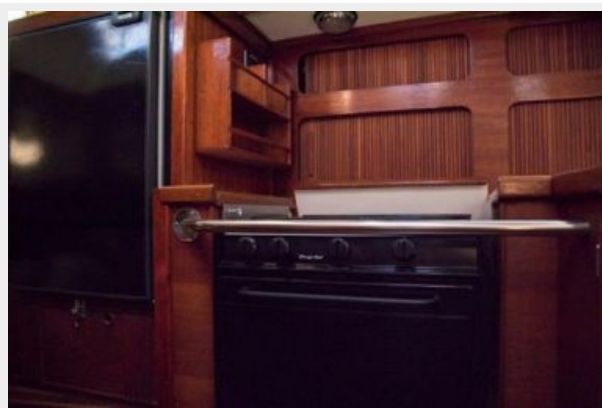
019 1989 Sabre Mark II Centerboard Galley Custom Spice Rack