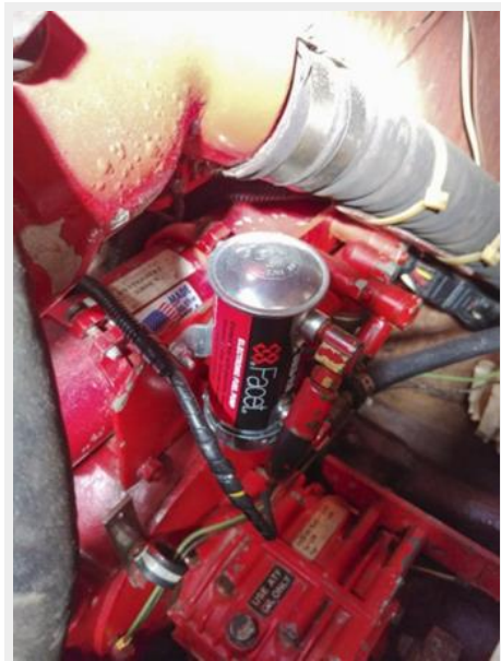
029 1989 Sabre Mark II Centerboard Engine Aft