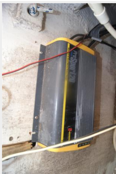
45 32' Hunter Vision battery charger