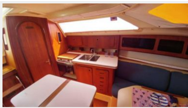
11 32' Hunter Vision galley a.