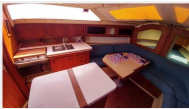
11 32' Hunter Vision galley c.