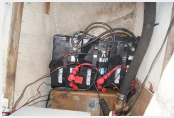
43 32' Hunter Vision Batteries