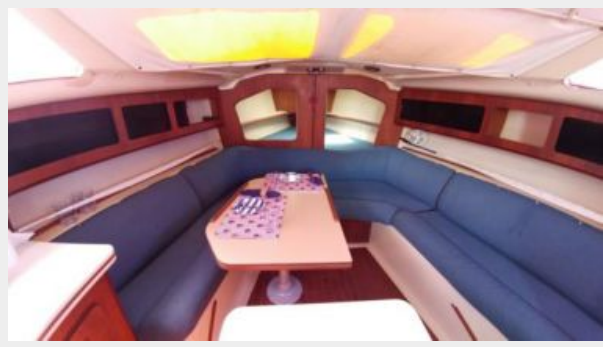
04 32' Hunter Vision interior forward