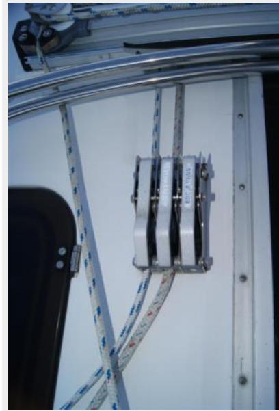
82 32' Hunter Vision Triple Clutch Port