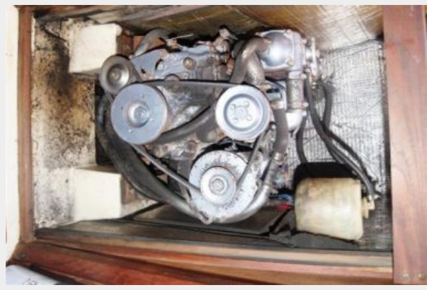
41 32' Hunter Vision engine