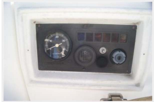
42 32' Hunter Vision Cockpit Engine gauges