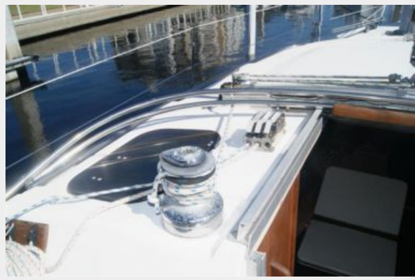
81 32' Hunter Vision port winch