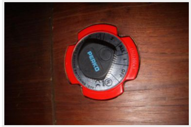
44 32' Hunter Vision battery switch