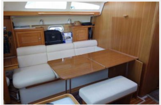
Salon Table Down