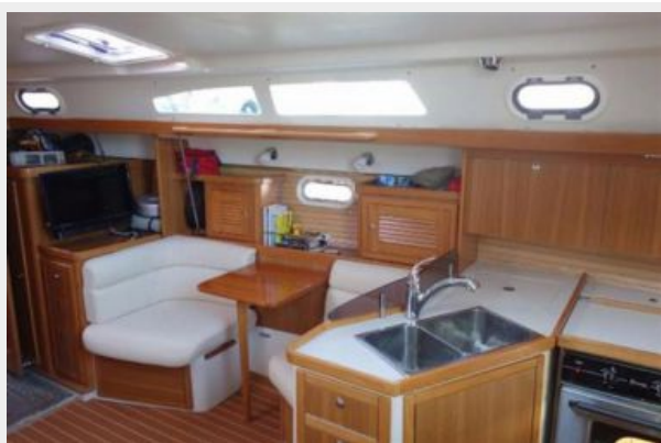
Salon - Starboard Side