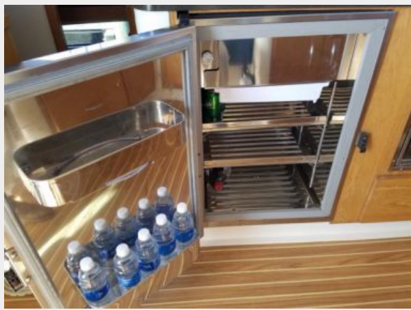
Broadblue 435ST refrigerator