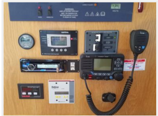
Broadblue 435ST instrument control panels