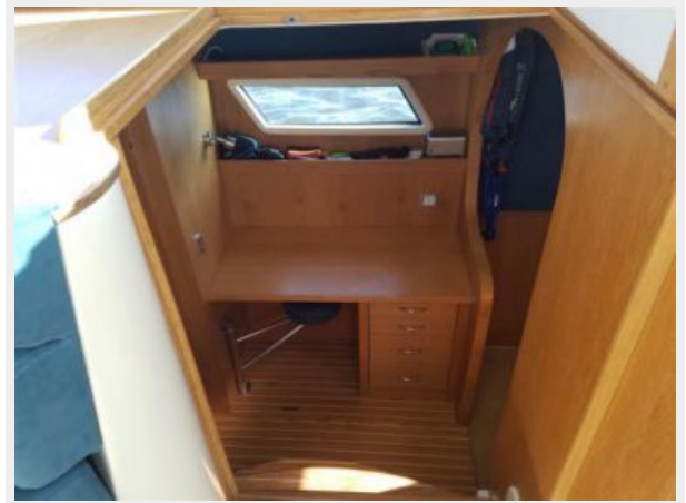
Broadblue 435ST starboard desk