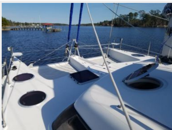
Broadblue 435ST foredeck