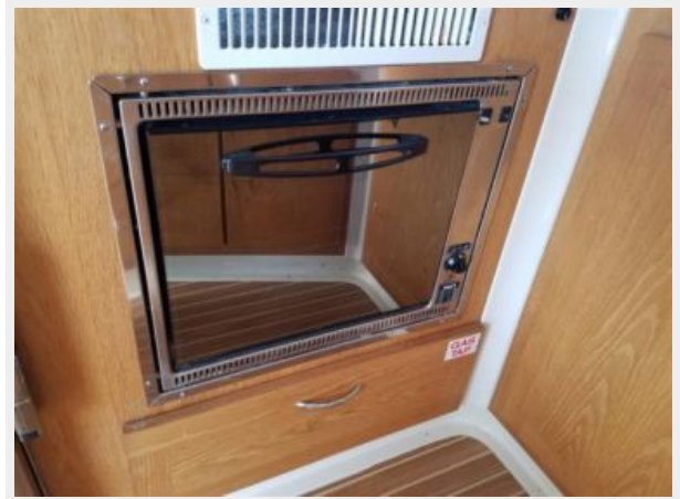
Broadblue 435T oven