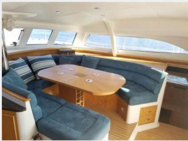
Broadblue 435ST salon table