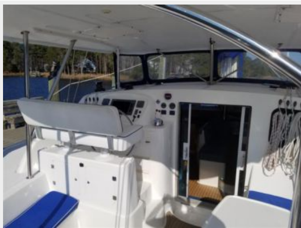
Broadblue 435ST helm