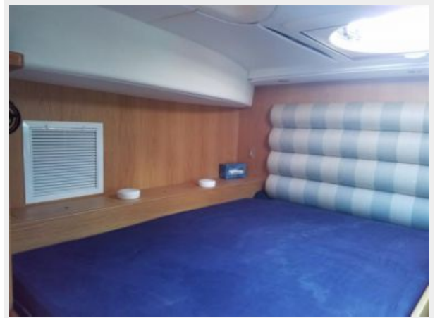
Broadblue 435ST port stateroom