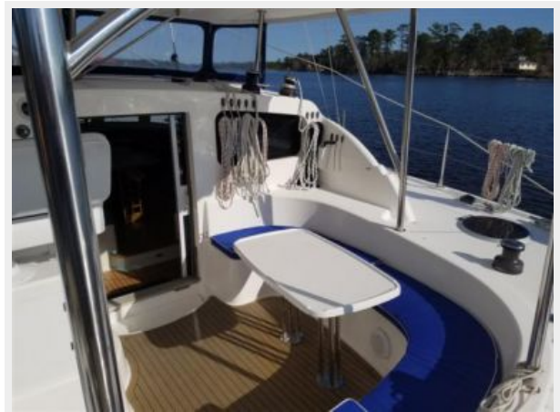
Broadblue 435ST cockpit table