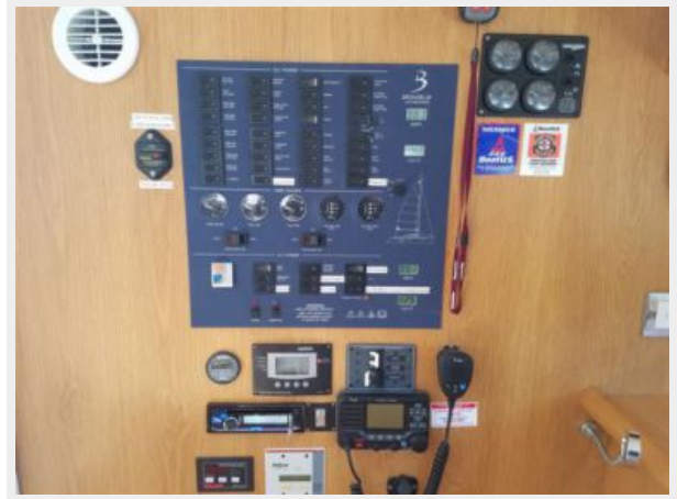
Broadblue 435ST main panel