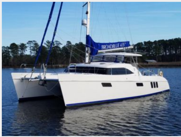
Broadblue 435ST port hull