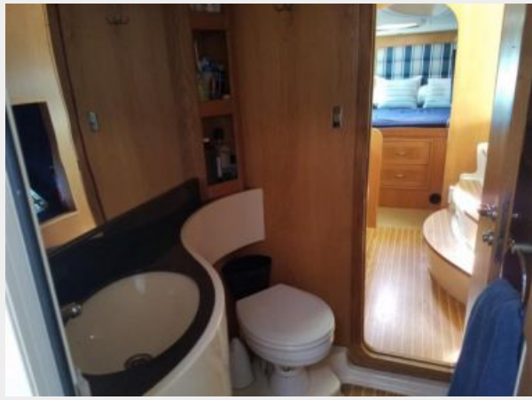
Broadblue 435ST master head