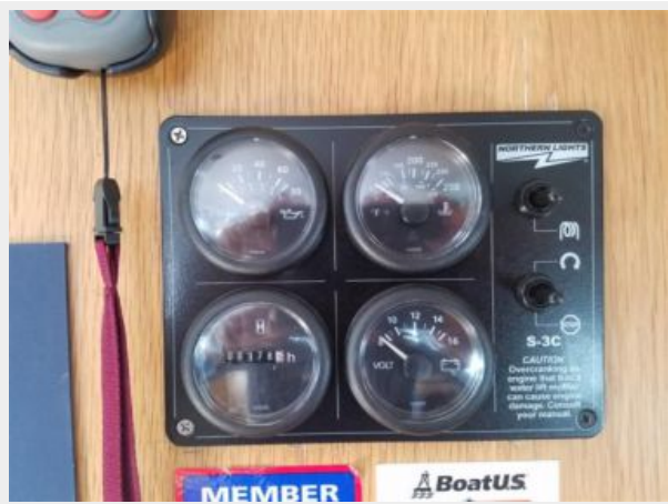
Broadblue 435ST generator instruments