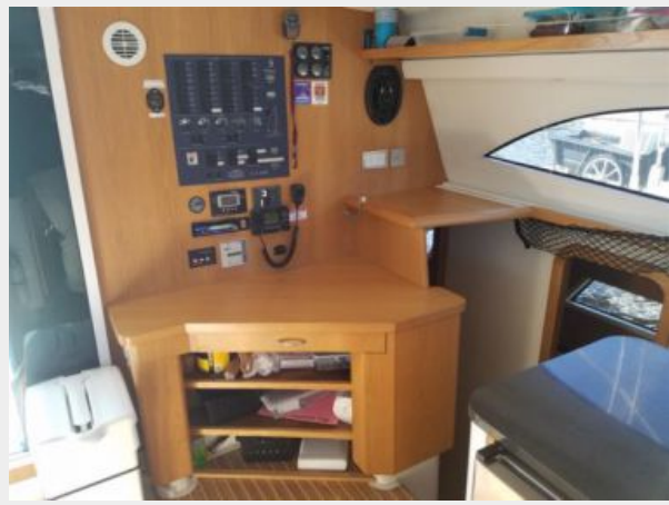
Broadblue 435ST nav station