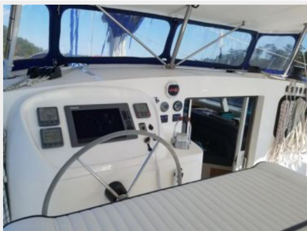
Broadblue 435ST helm and instruments