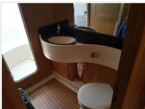
Broadblue 435ST master head