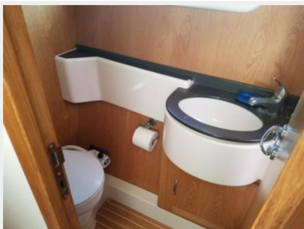
Broadblue 435ST guest head