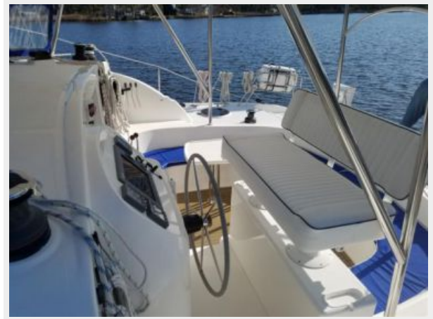
Broadblue 435ST helm seat