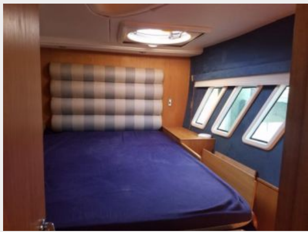
Broadblue 435ST port stateroom, aft