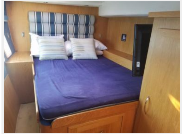
Broadblue 435ST master cabin