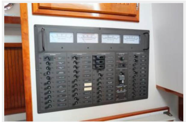
WATER MUSIC 2004 Shannon SRD 38 Downeast