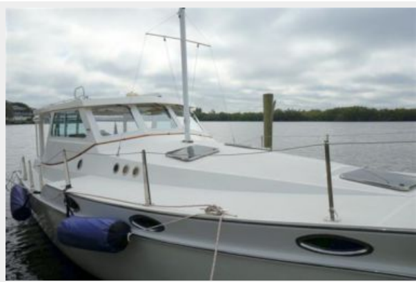
WATER MUSIC 2004 Shannon SRD 38 Downeast