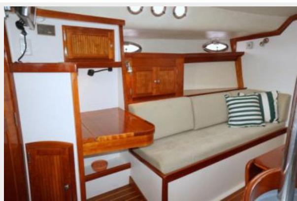
> WATER MUSIC 2004 Shannon SRD 38 Downeast