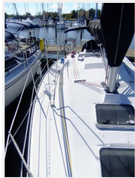
Beneteau 285 - Starboard Side Decking to Aft