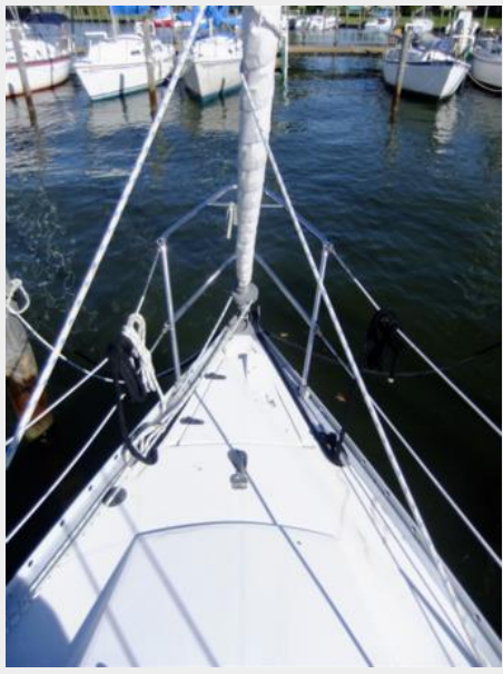
Beneteau 285 - Forwadr Deck