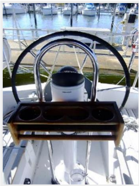
Beneteau 285 - Cockpit Helm Station