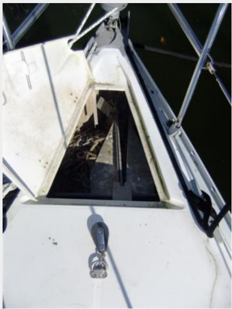
Beneteau 285 - Forwadr Deck Anchor Locker (Open)