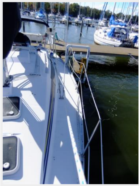
Beneteau 285 - Port Side Decking to Aft