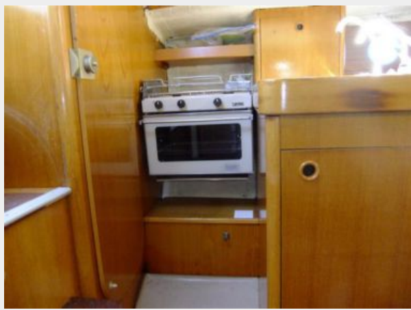
Beneteau 285 - Galley Range