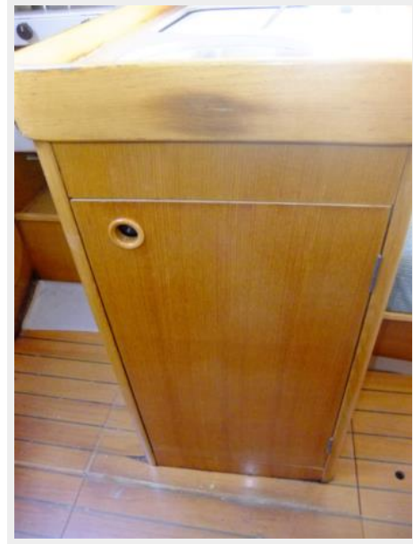
Beneteau 285 - Galley Range with Understorage