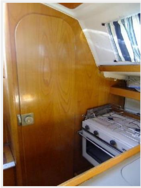
Beneteau 285 - Aft Berth Privacy Door