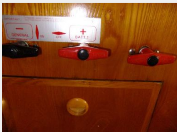
Beneteau 285 - House & Starter Battery Controls Aft Berth