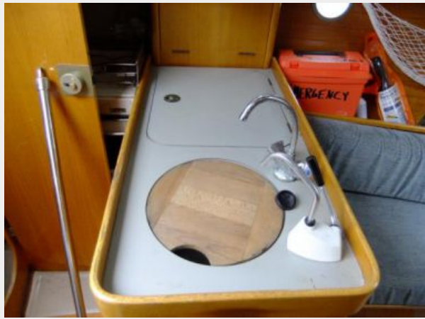
Beneteau 285 - Galley Pic II.