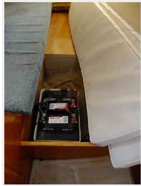
Beneteau 285 - Aft Berth Under Storage - House & Starter Batteries