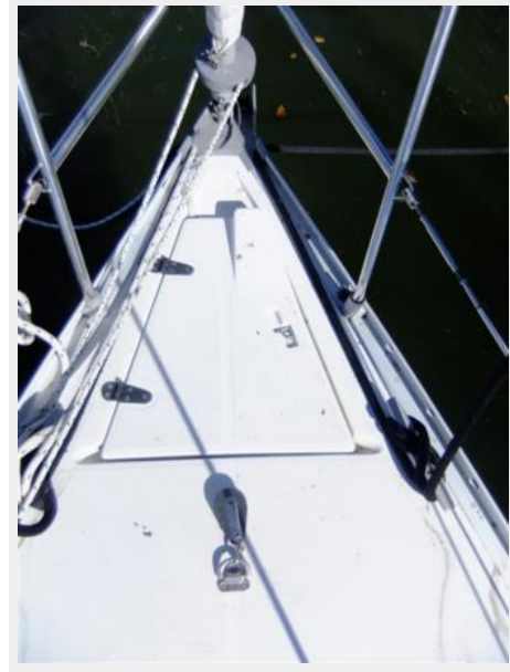
Beneteau 285 - Forwadr Deck Anchor Locker