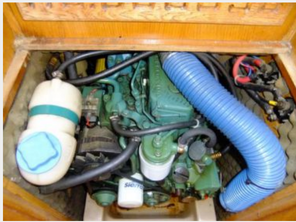
Beneteau 285 - Engine - Volvo Penta 2000 Pic II