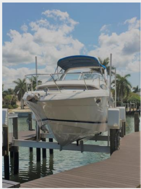
Bow on Lift