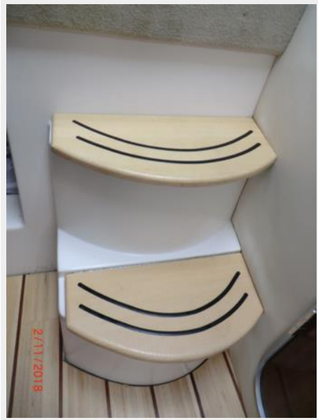
Entry Steps with Storage