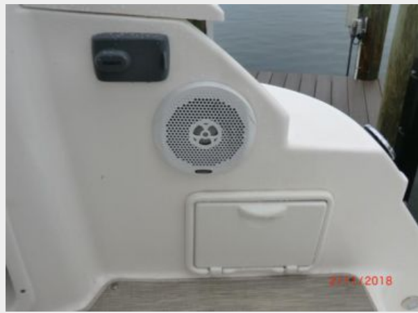
Stereo and Shower