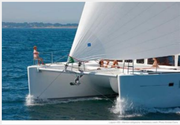
Manufacturer Provided Image: Lagoon 450