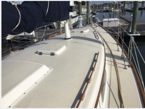
Deck View Starboard