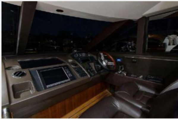
60 Princess Helm