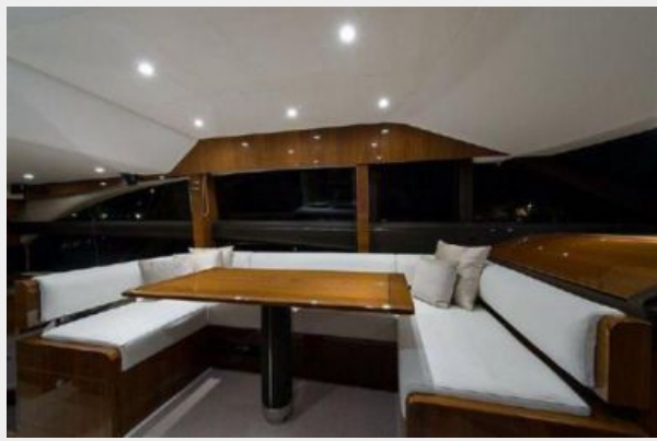
60 Princess Dinette