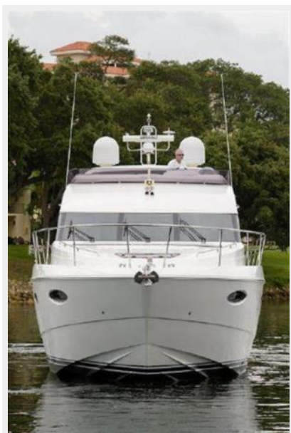
60 Princess Bow