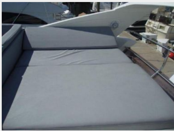
60 Princess Flybridge Lounge Seating