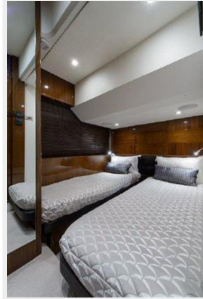
60 Princess Guest