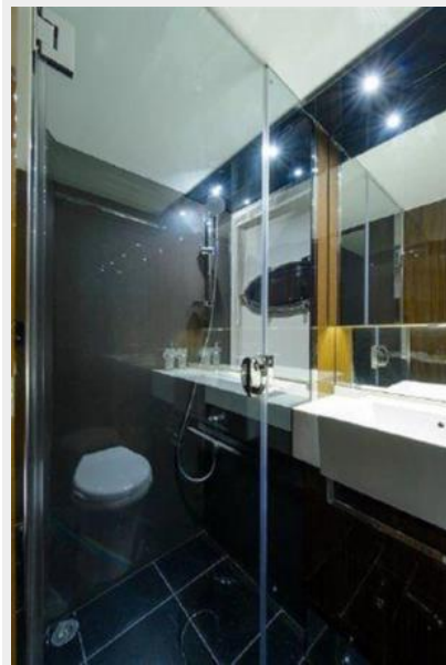
60 Princess Head