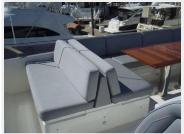
60 Princess Flybridge Seating