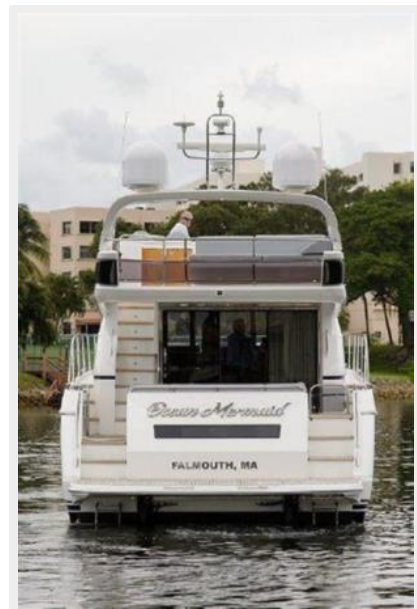
60 Princess Stern