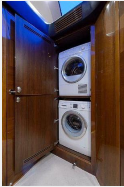
60 Princess Washer/Dryer