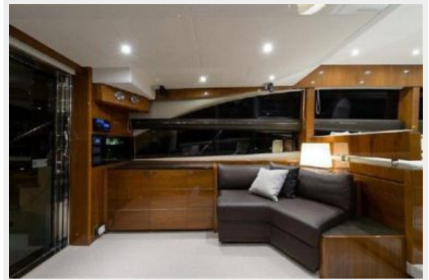
60 Princess Salon