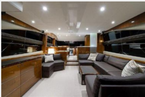
60 Princess Salon