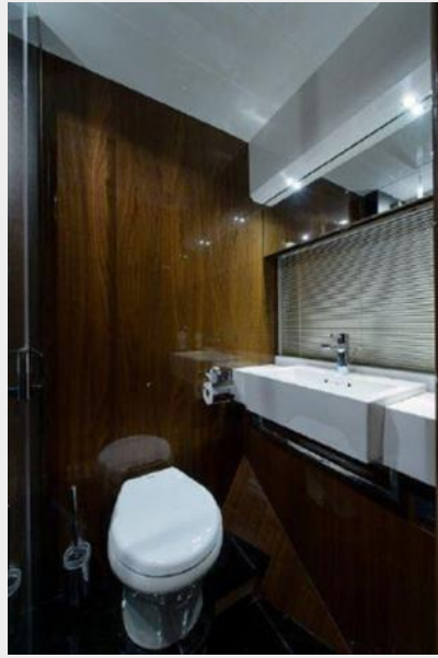
60 Princess Head