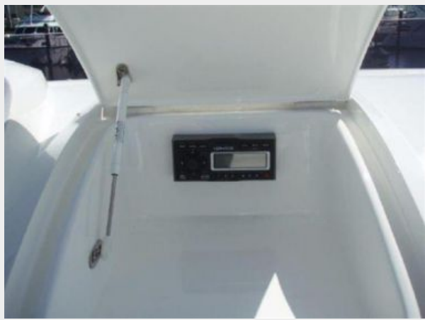
60 Princess Flybridge Controls