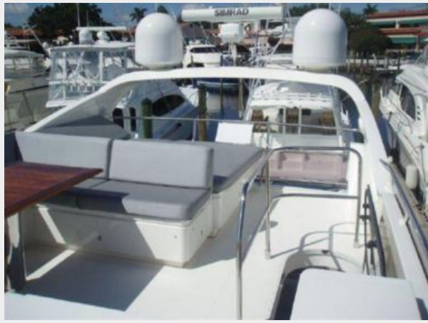
60 Princess Flybridge Looking Fwd