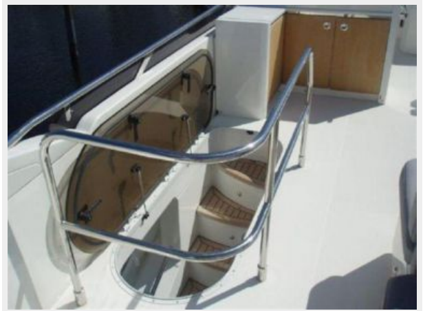
60 Princess Stairwell