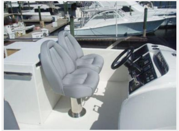
60 Princess Flybridge Helm