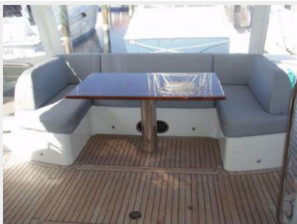
60 Princess Flybridge Dinette