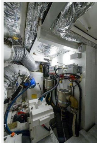
60 Princess Engine Room