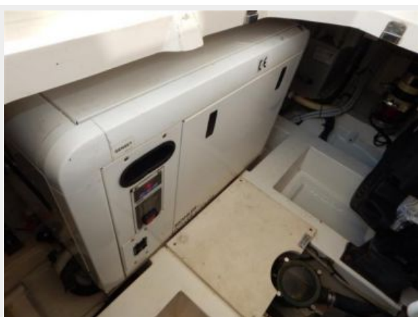
Generator in Soundbox