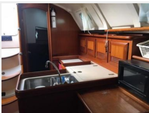
Main cabin looking forward from the galley