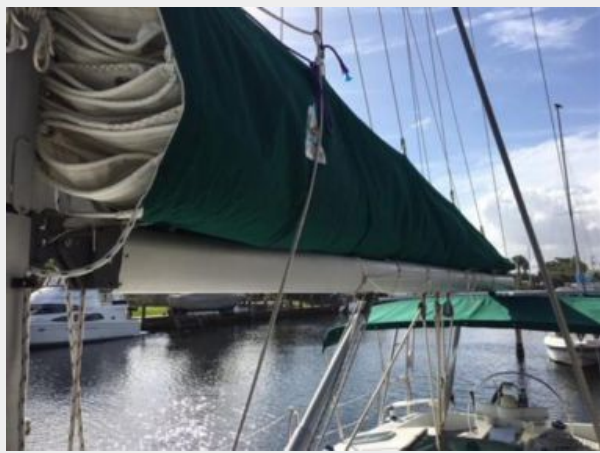
Doyle stack pack new in 2016