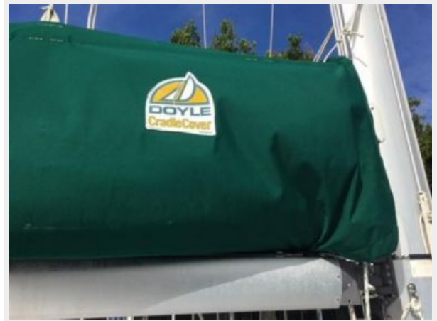
Doyle Stack pack new in 2016