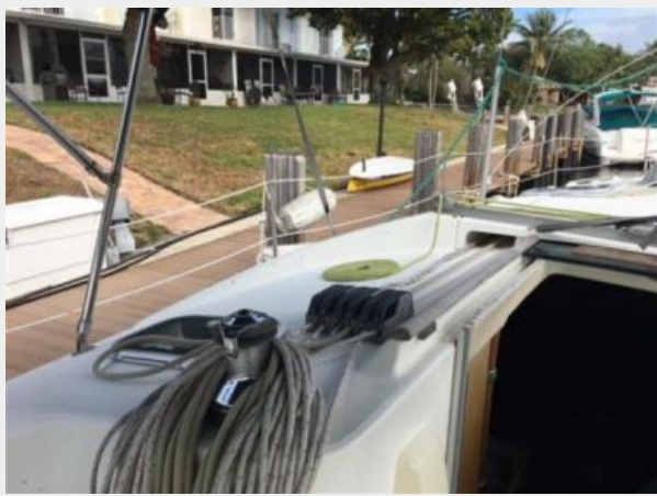
View to port from the cockpit