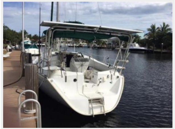
View of the transom