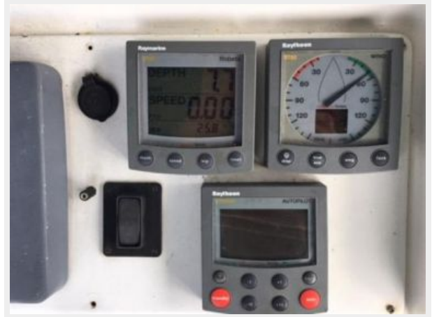
Raymarine electronics at the helm station