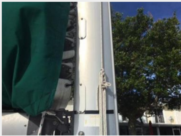
Doyle stack pack and new main in 2016