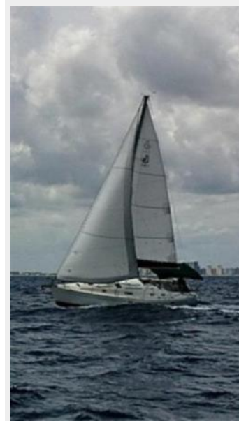
Port tack, going to weather nicely