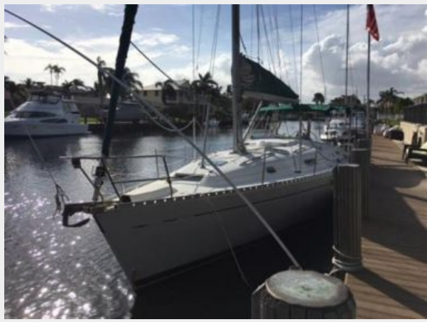
Port side bow