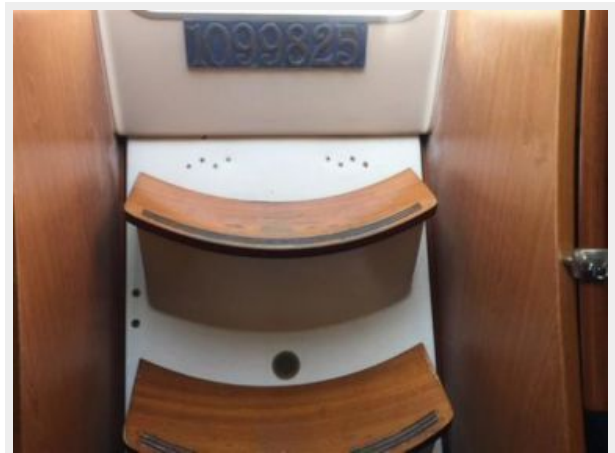
Companion way ladder and documentation number