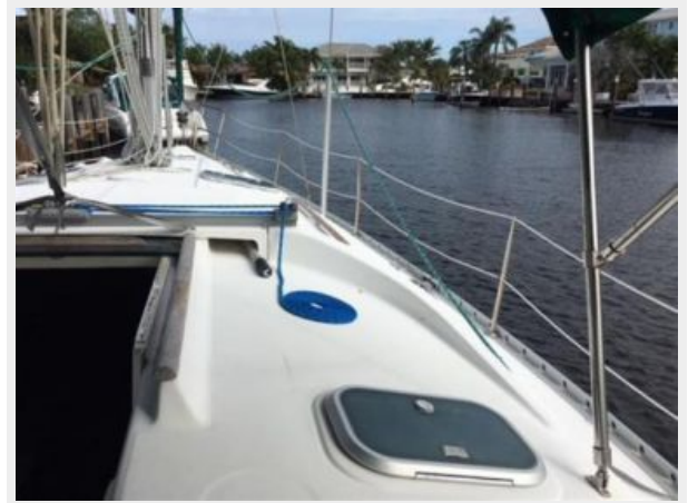
View to starboard from the cockpit