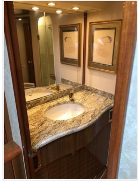
Master Head 1