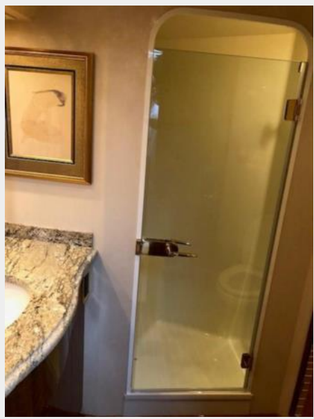
Master Head 2 - Shower