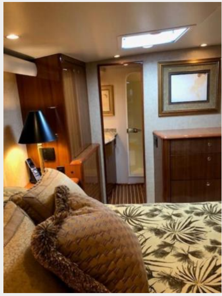
Master Stateroom 3