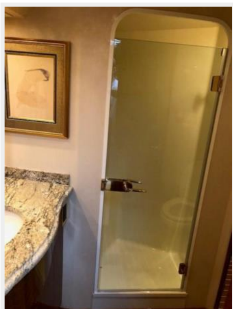
Master Head 2 - Shower