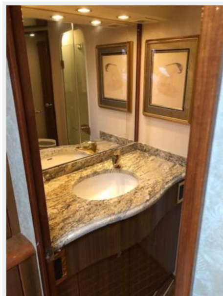
Master Head 1