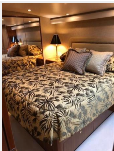
Master Stateroom 1