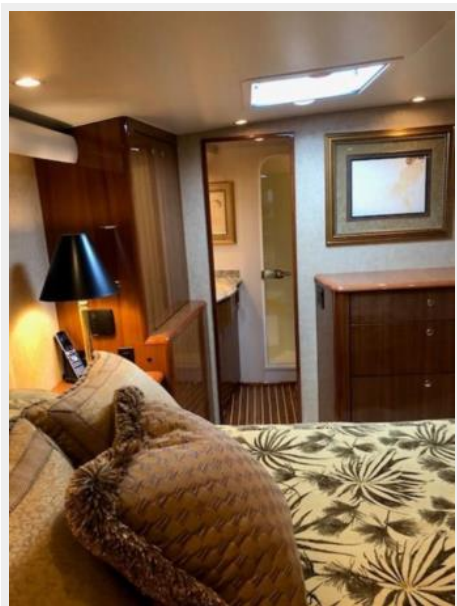
Master Stateroom 3