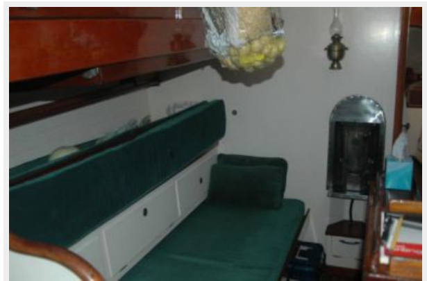
Main Salon Port