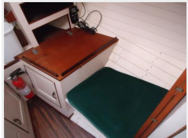
New Fwd. Deck