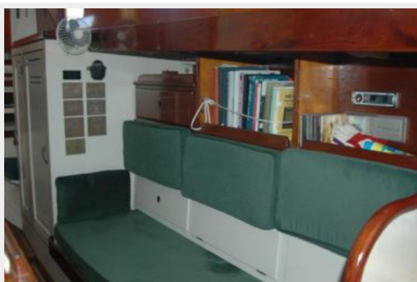
Main Salon Stb