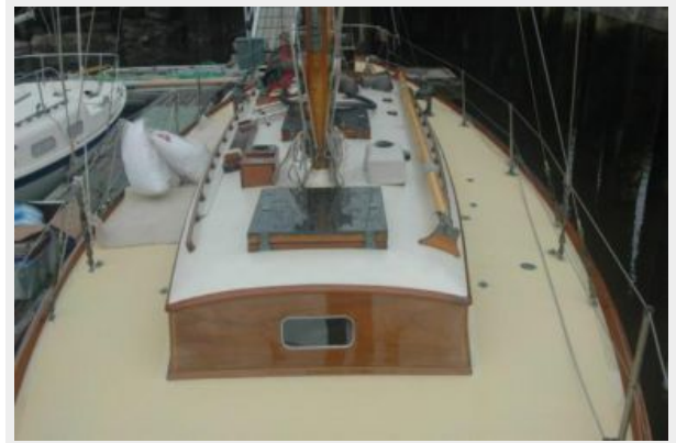
Deck View Aft