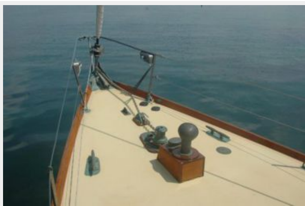
Foredeck & Windlass