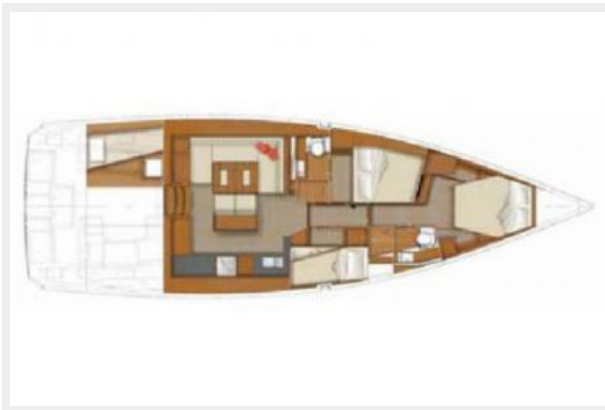
3 Cabin Layout