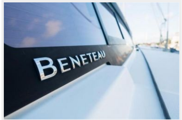
Starboard side Beneteau logo