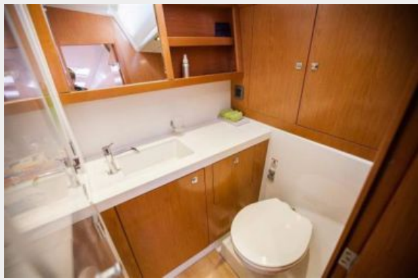
Head with separate shower