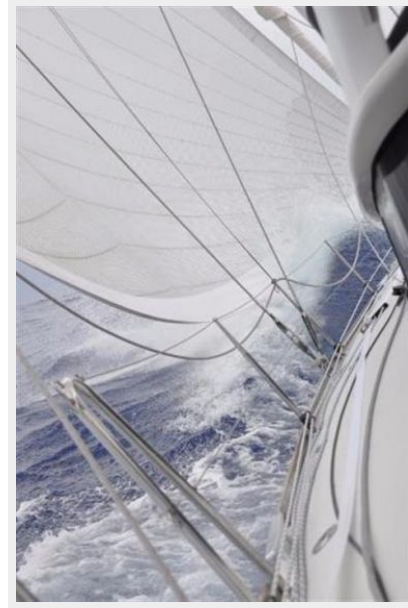
Mid Ocean on starboard tack