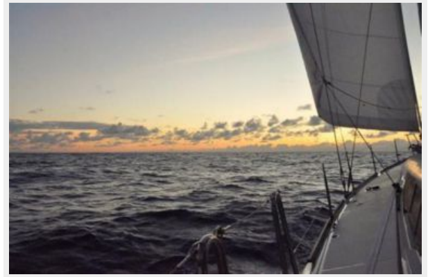
A new day.