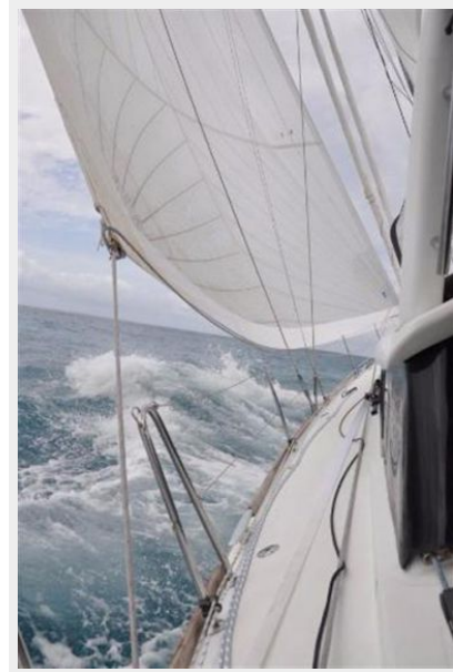
Mid Ocean on starboard tack