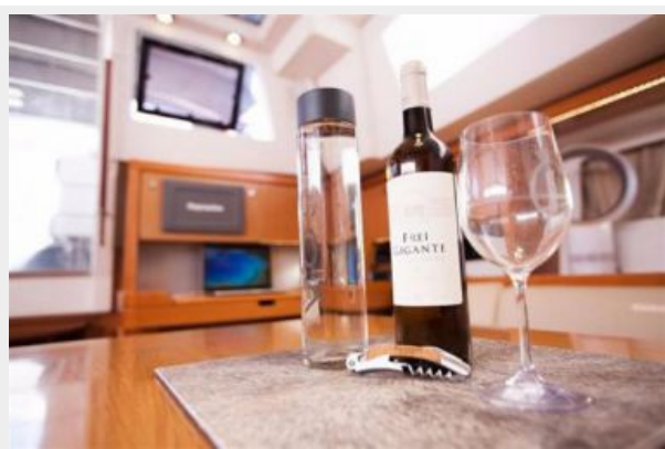
Detail showing the large convertible table and chart table