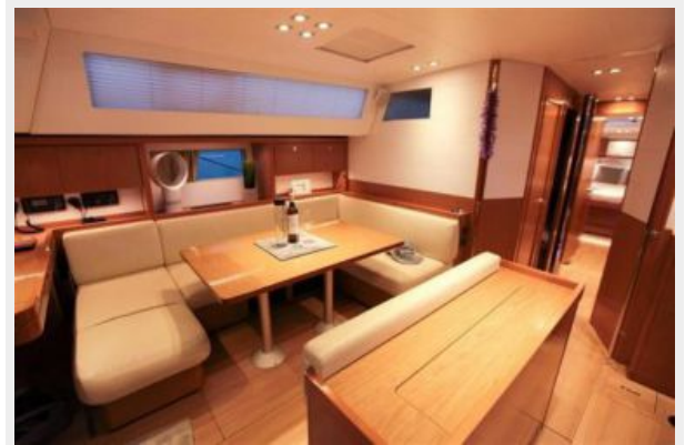
Saloon port side convertible table