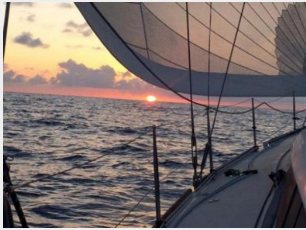
The good weather returns