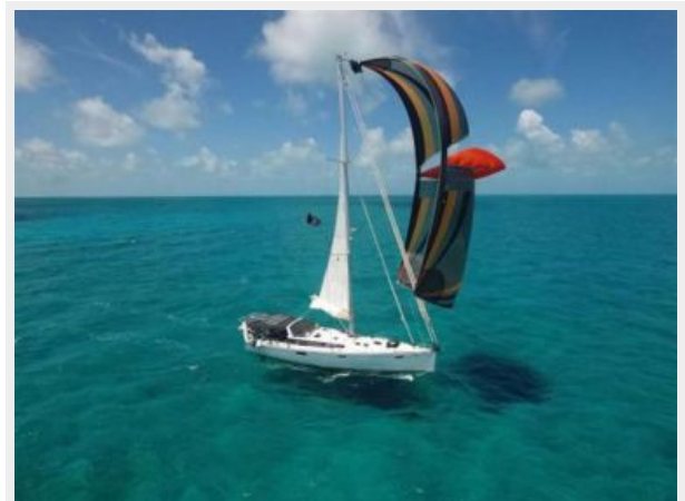
Parasailor looking great