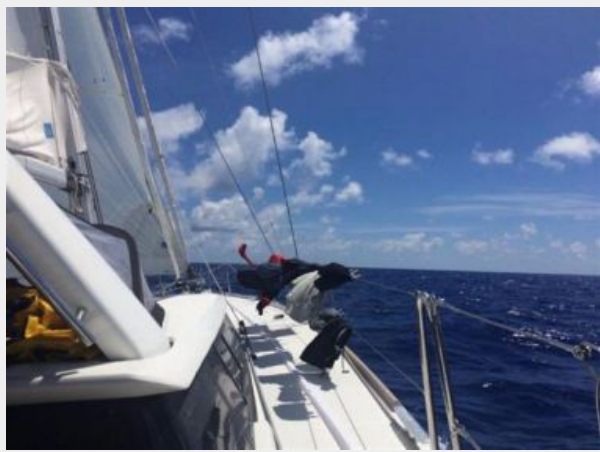
Mid Ocean drying the Laundry dries fast in the breeze.