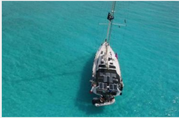
Beautiful anchorage and great view of the solar panels