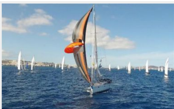
Port tack going fast with Parasailor