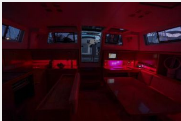
Indirect lighting in the saloon, can be any color or intensity.