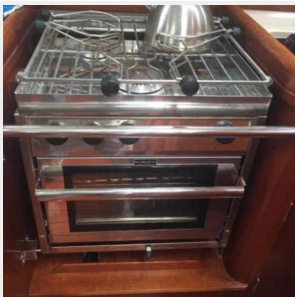
Stove with oven