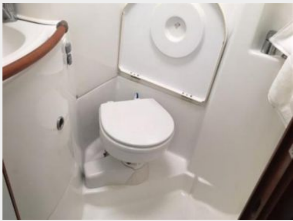
Forward head and shower stall