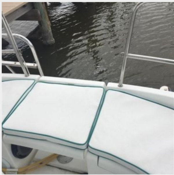
New cockpit cushions