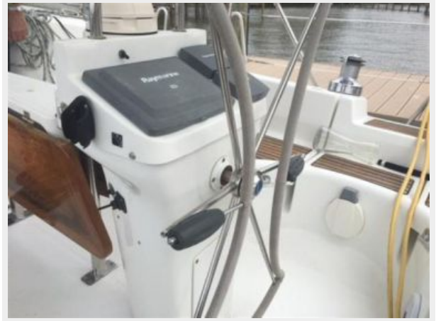
Lewmar folding wheel