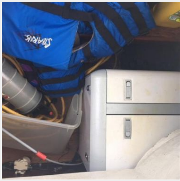
Whisper 7.5 KW generator in starboard lazerette