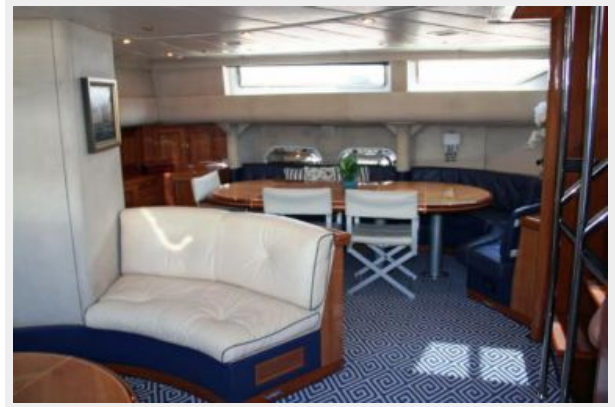
Main Salon - Port