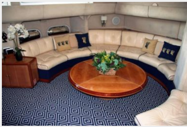
Main Salon Lounge - Starboard