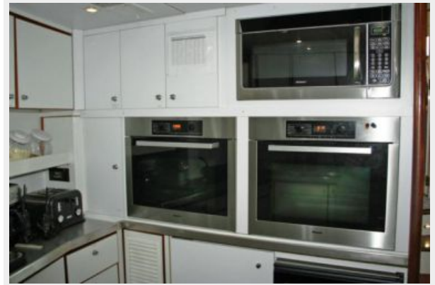
Ovens - Microwave