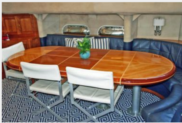
Main Salon Dining