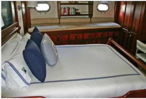
Owner's Stateroom - Port