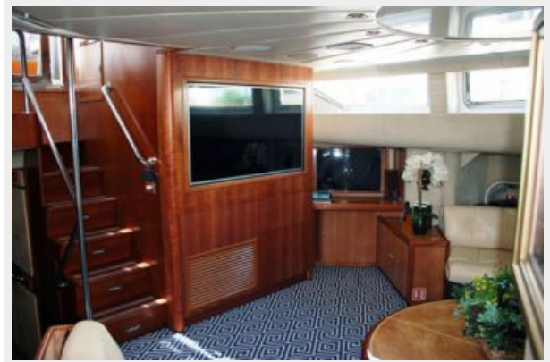
Main Salon TV - Office Area