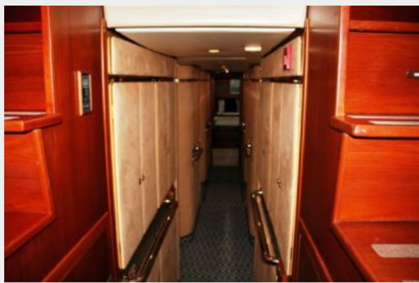
Passageway to Staterooms