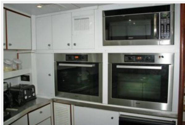
Ovens - Microwave