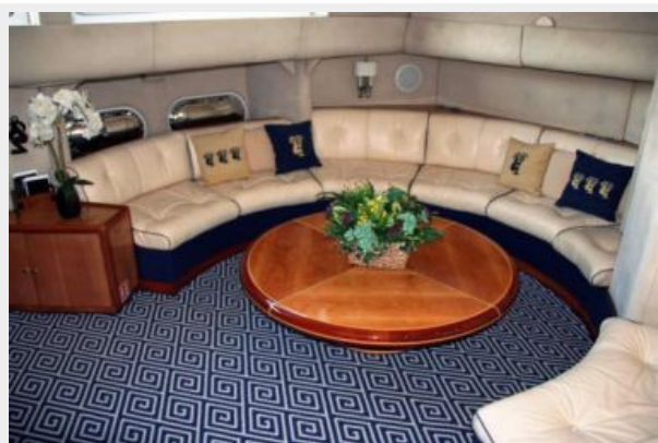
Main Salon Lounge - Starboard