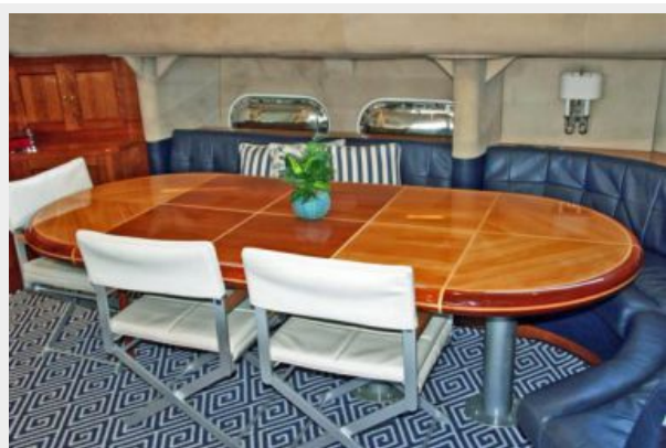
Main Salon Dining