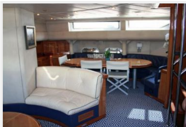
Main Salon - Port