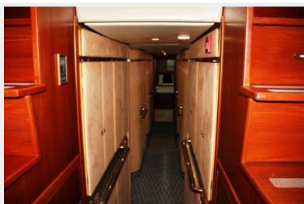
Passageway to Staterooms