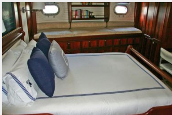
Owner's Stateroom - Port