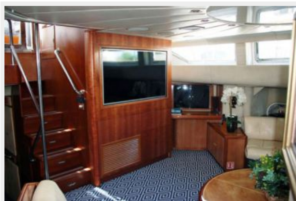
Main Salon TV - Office Area