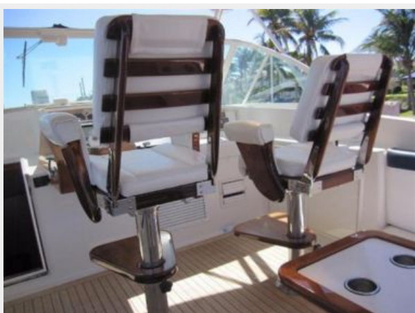
Helm Chair Detail