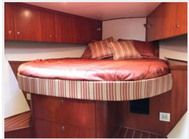
Forward Master Stateroom