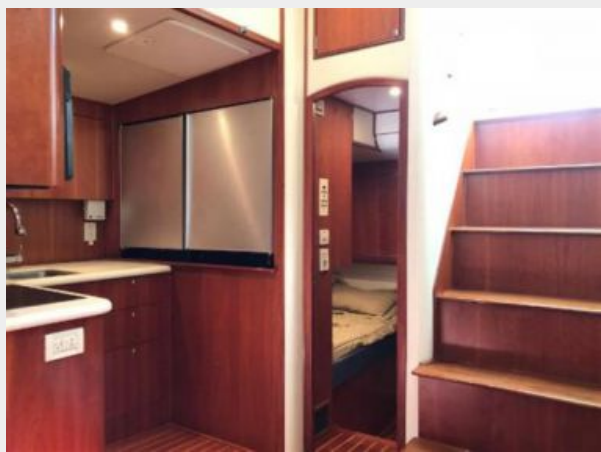
Starboard Aft Galley