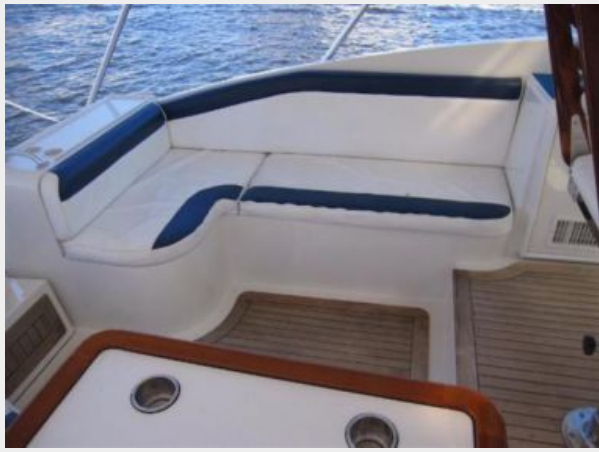
Helm Deck Seating