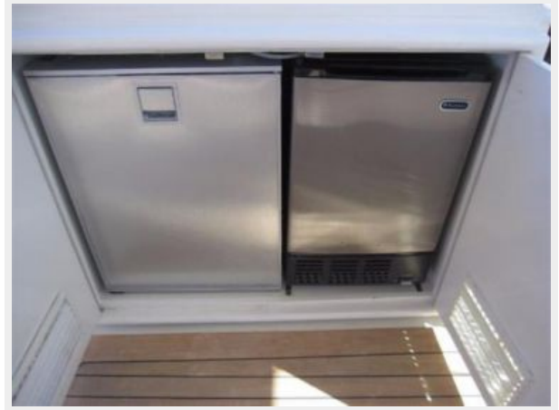
Helm Deck Refrigerator and Icemaker