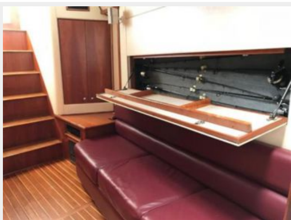
Main Salon Rod Storage