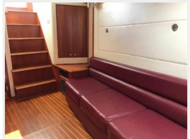
Main Salon Couch