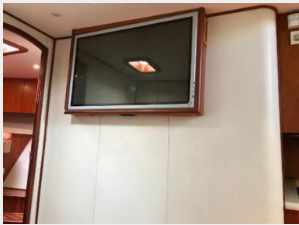
Main Salon LCD TV