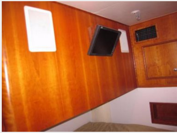
VIP Stateroom TV