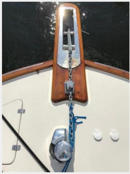
Anchor and Anchor Windlass