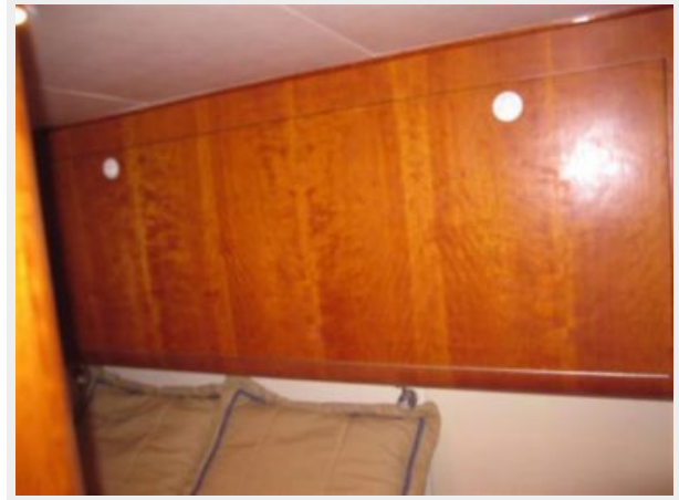
VIP Stateroom Pullman Berth