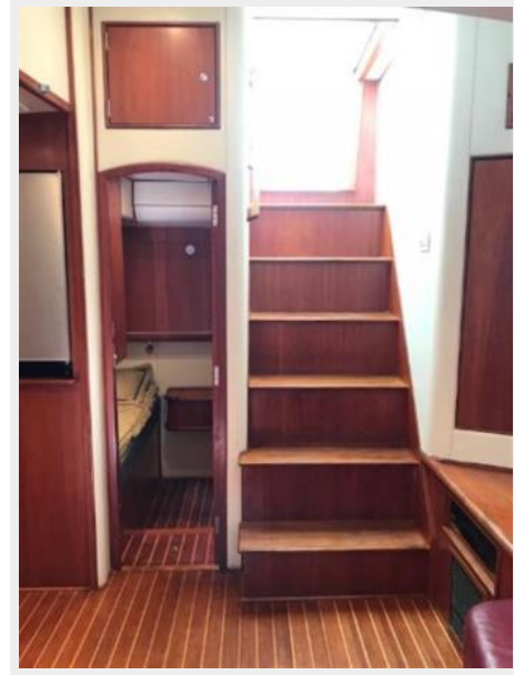
Stairway from Helm Deck