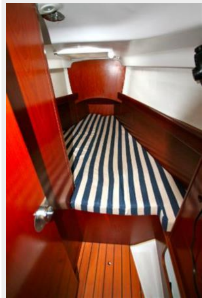
Large V berth