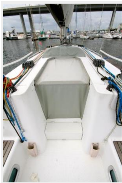
Canvas covers over companionway and instruments