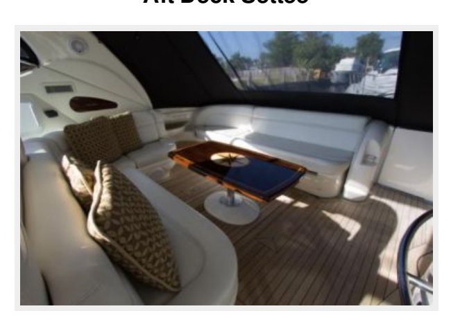
Aft Deck Settee