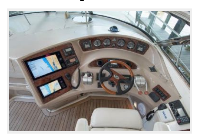
2016 Navigation Electronics