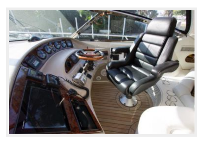
New Helm Chair