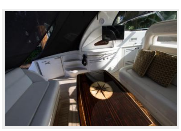
TV and Wet Bar