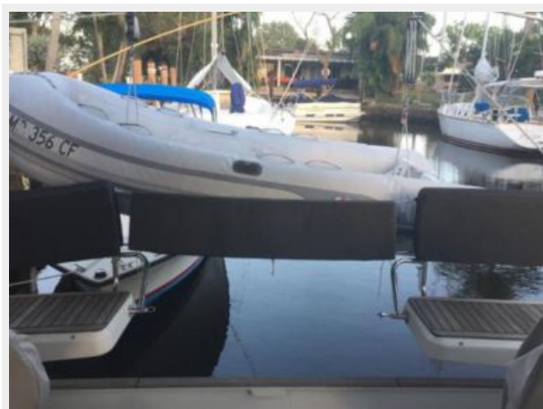
12' Dinghy on Davits