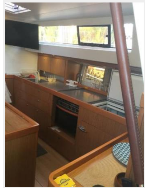
Galley view from companionway