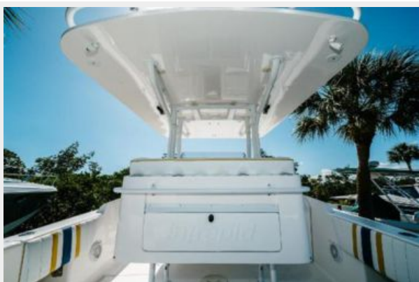
Tackle Station / Hard Top