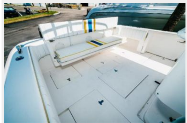
Cockpit with Fold Down Seating