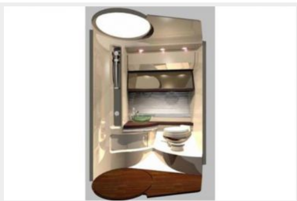
Manufacturer Provided Image: Owners Head