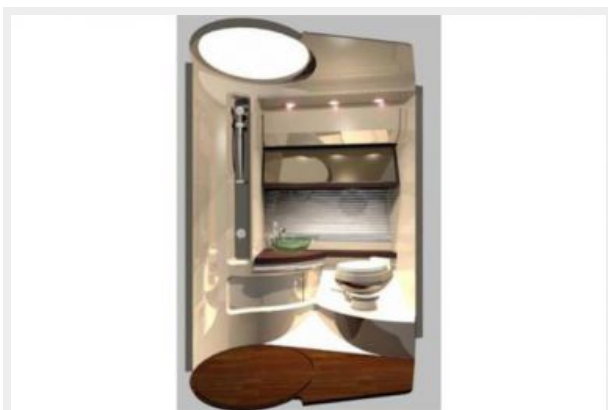
Manufacturer Provided Image: Owners Head