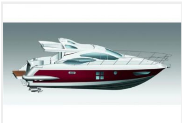
43S Profile