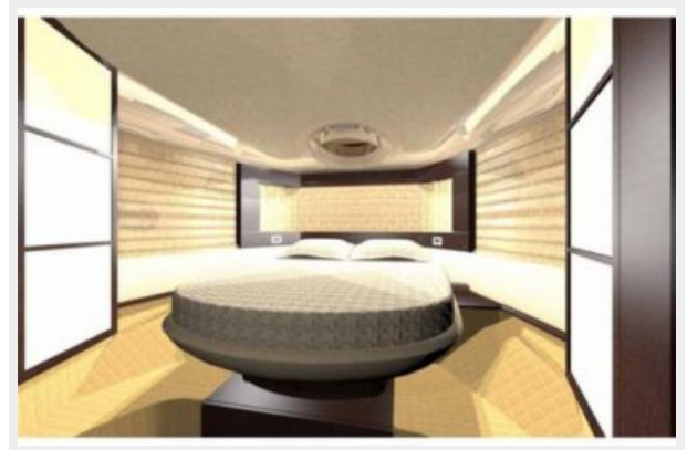
Owners Cabin