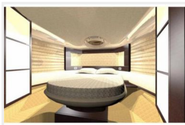
Owners Cabin