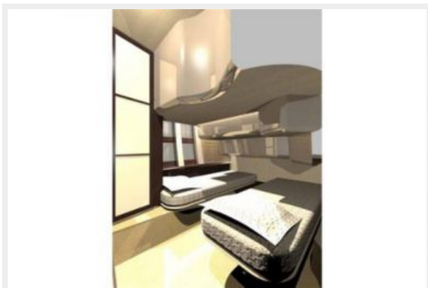
Guest Cabin